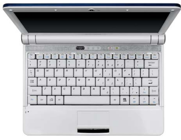
Lenovo IdeaPad S10 Deep Blue