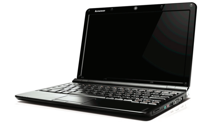
Lenovo IdeaPad S12 (VIA or Intel platform) Black with 3-cell battery