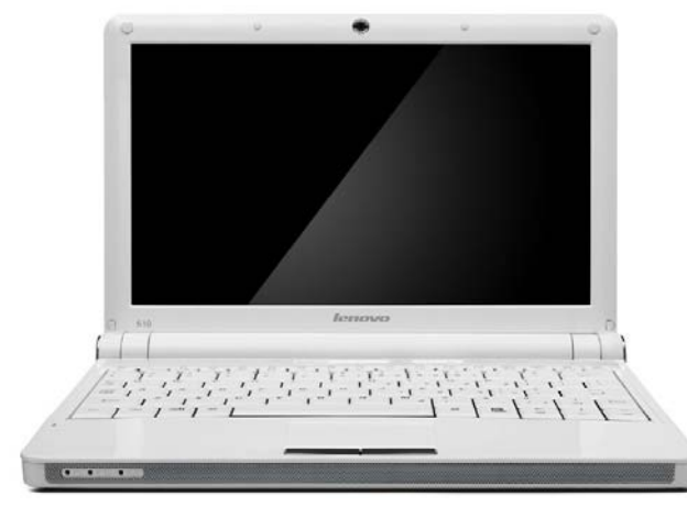
Lenovo IdeaPad S10 Classic White