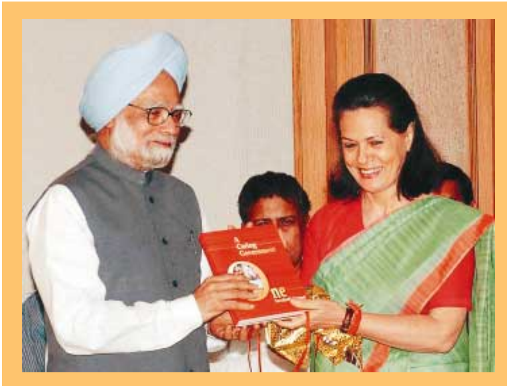
UPA Chairperson, Smt Sonia Gandhi and Prime Minister, Dr. Manmohan Singh releasing a report titled 'A Caring Government: One Year Completion of UPA Government', in New Delhi on 22nd May 2005.