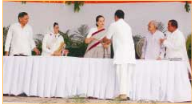
Shri Oscar Fernandes, Chairman CEC completing the formalities of election process of Congress President at the AICC headquarters