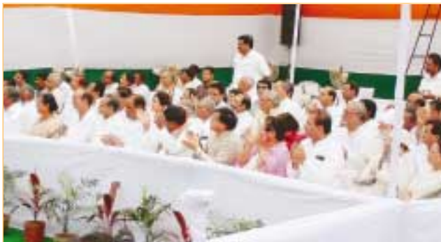
Huge gathering of Senior Congress leaders witness the occasion