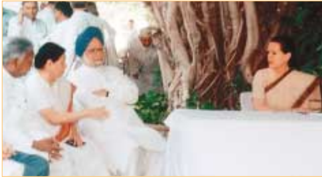
Prime Minister Dr. Manmohan Singh, the proposer, and other senior leaders during the filing of nomination of Smt. Sonia Gandhi