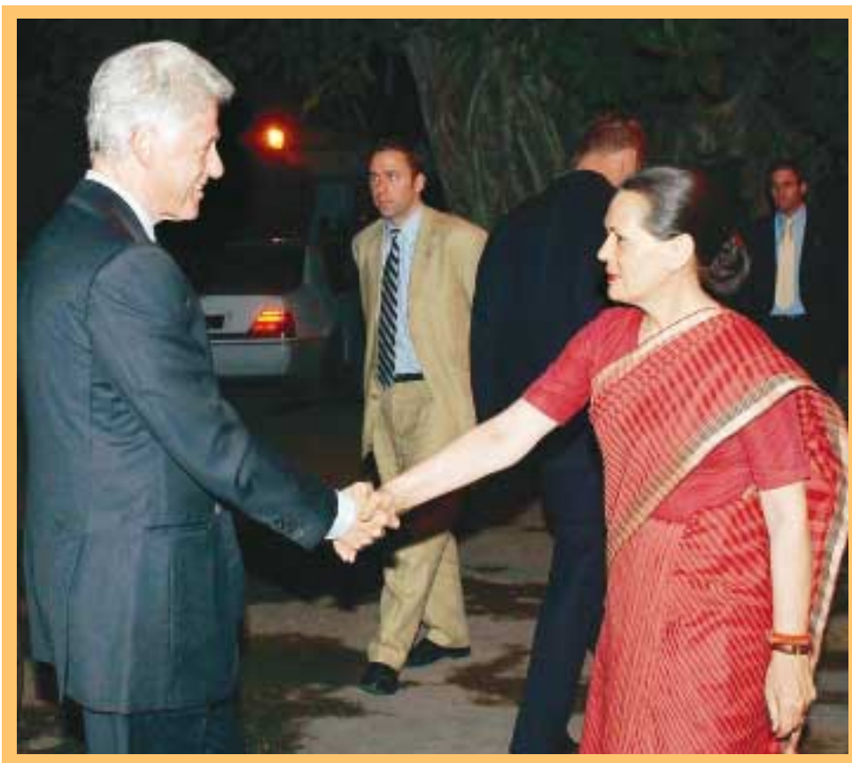
Congress President and UPA Chairperson, Smt. Sonia Gandhi, with former President of the United States, Mr. Bill Clinton, during their meeting in New Delhi on 26th May 2005.