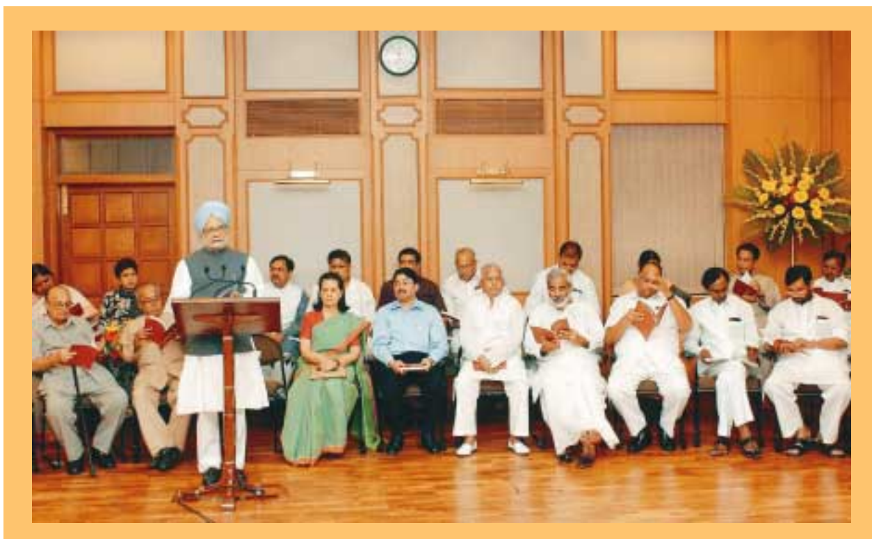
Prime Minister, Dr. Manmohan Singh, addressing a meeting on the completion of one year of UPA Government in New Delhi on 22nd May, 2005. Also seen are UPA Chairperson, Smt Sonia Gandhi and other alliance partners of the UPA.