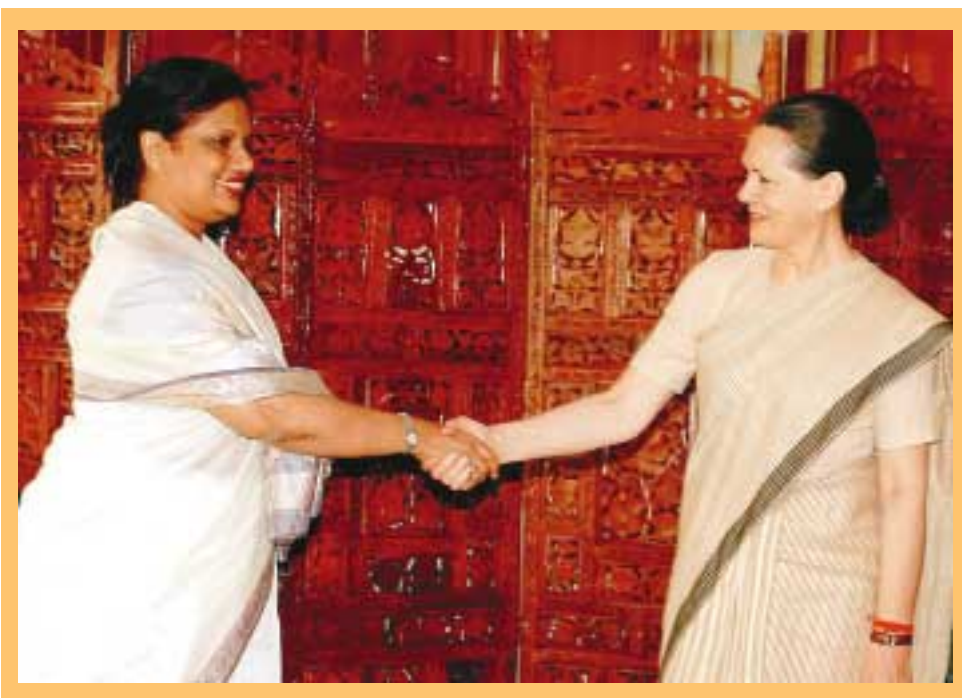
Congress President and UPA Chairperson, Smt. Sonia Gandhi calls on Sri Lanka President, Smt. Chandrika Kumaratunge, in New Delhi on 3rd June 2005