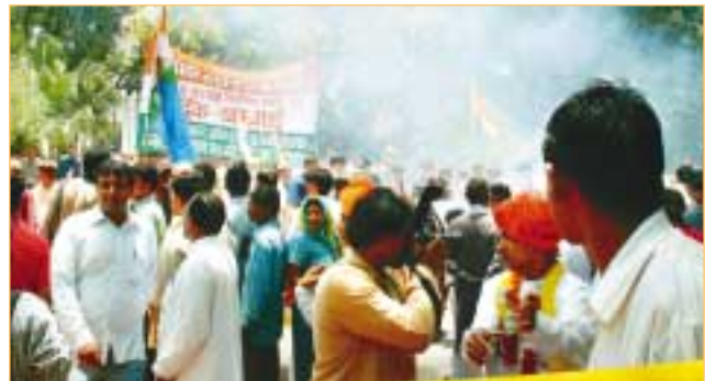
Congress workers in jubilant mood outside the AICC headquarters