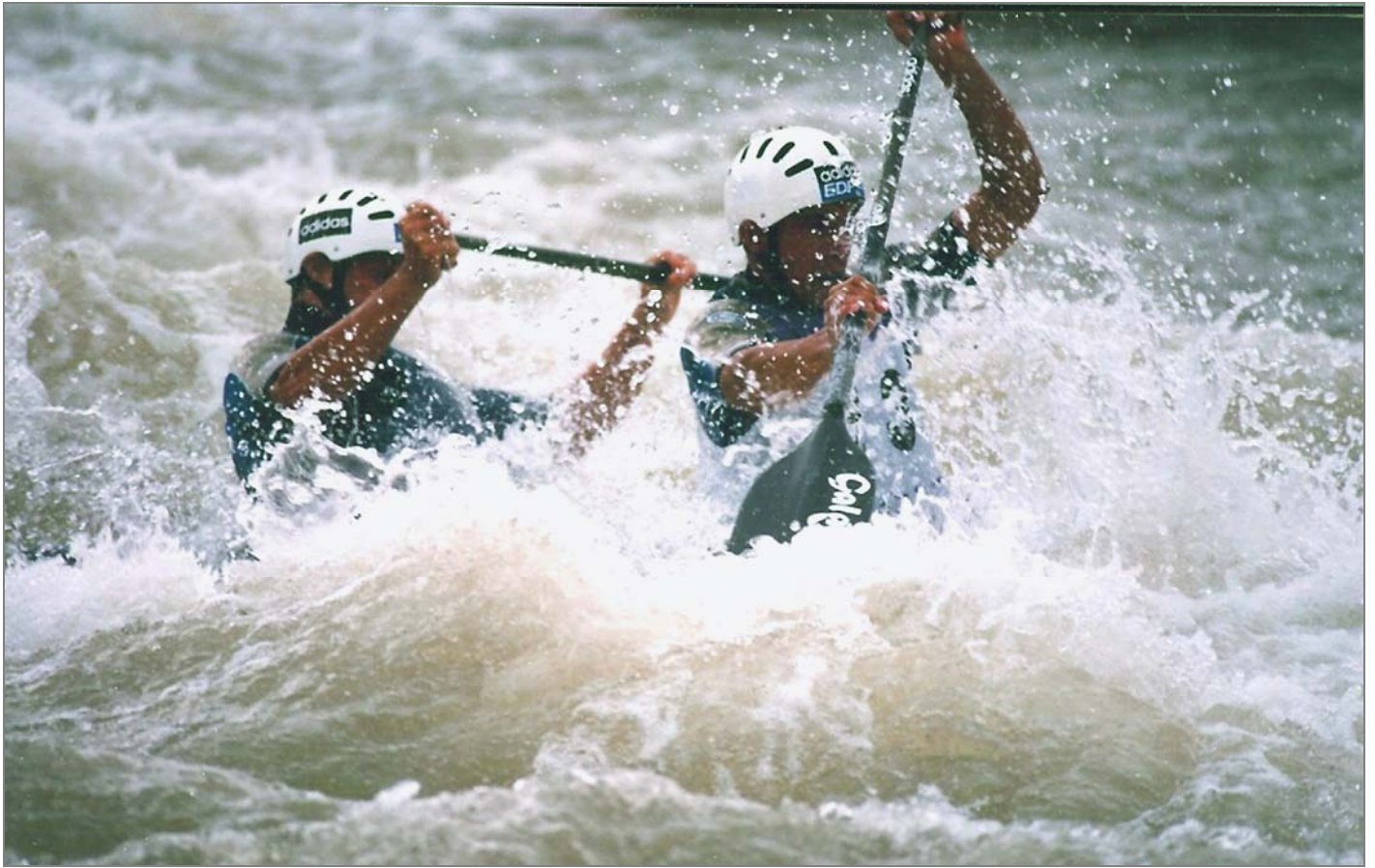
Slalom Racing C2 men