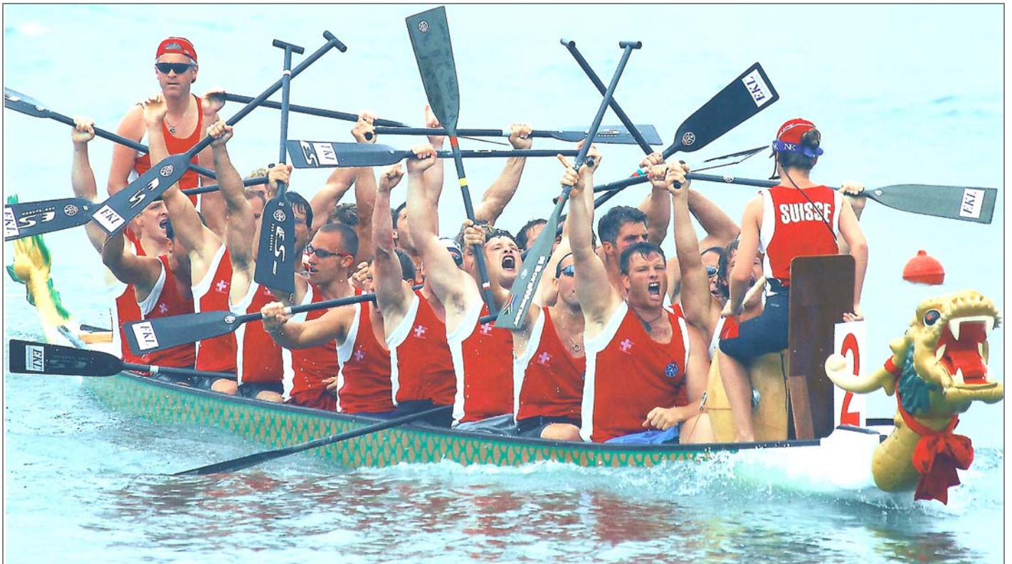
World Championships Dragonboat Racing 2006 Kaohsiung, Men 250 m