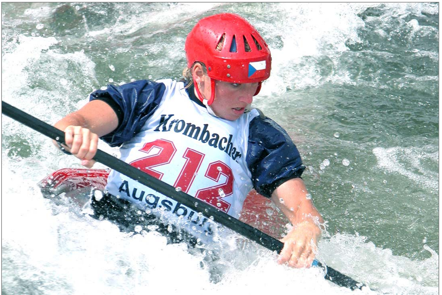
Slalom Racing K1 women