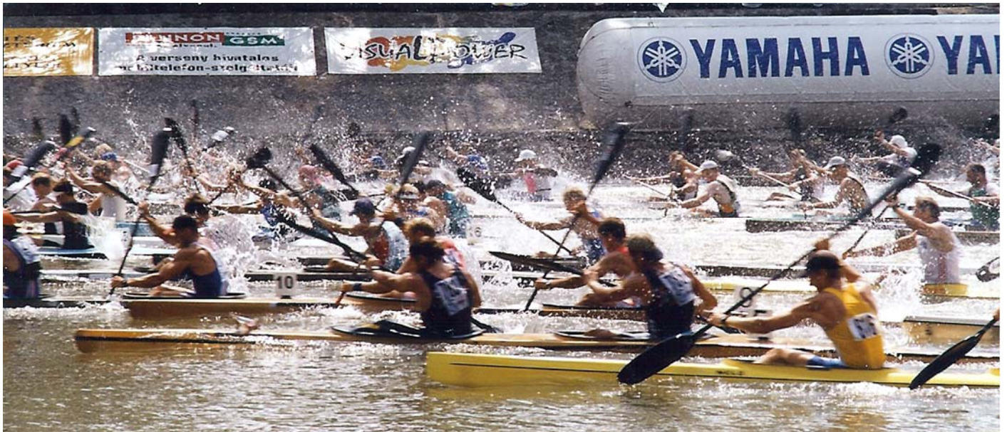
World Championships Marathon Racing 1999 Győr, Start