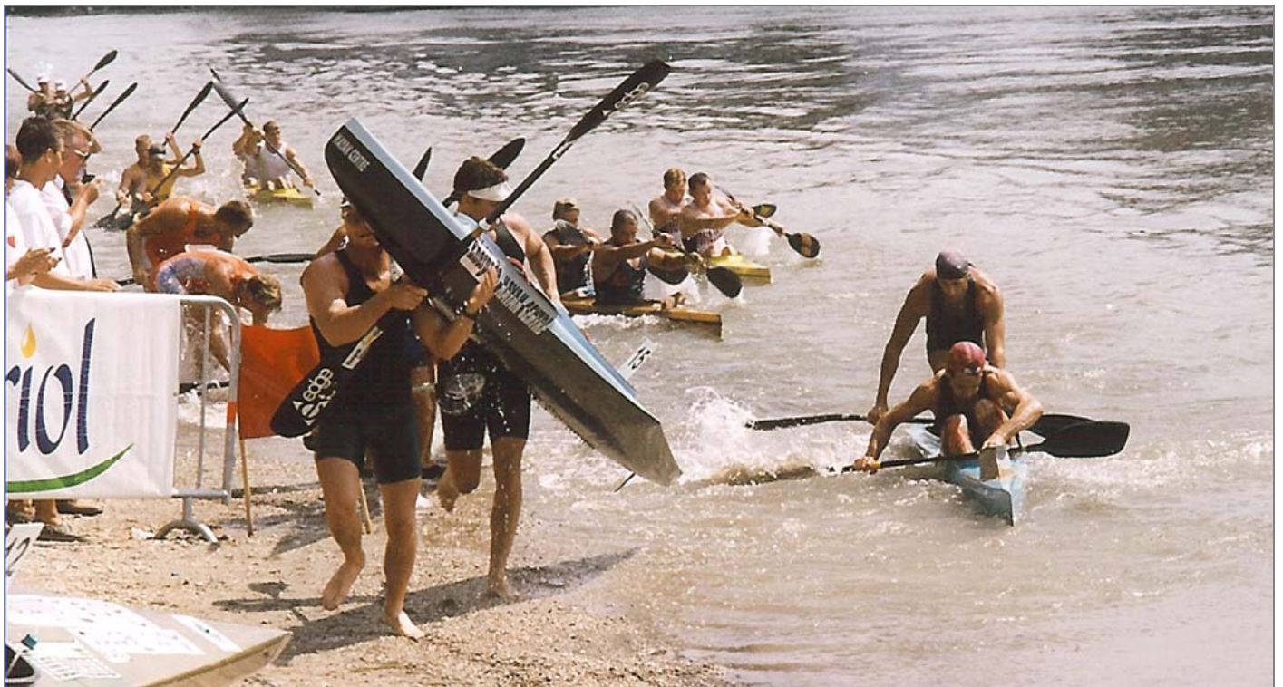
World Championships Marathon Racing 1999 Győr, the portage