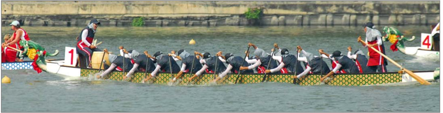
World Championships Dragonboat 2006, the Women Crew from Iran