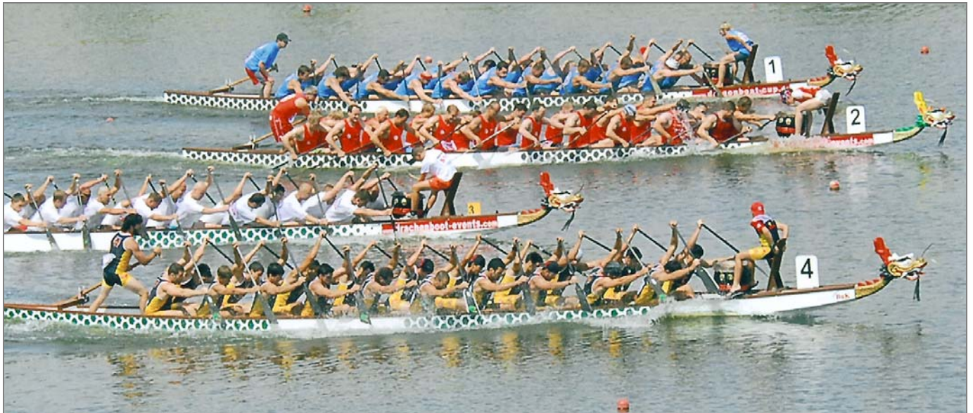
World Championships Dragonboot, close race