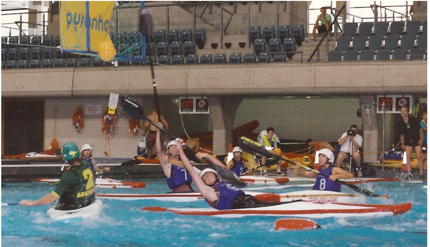
First World Chamionships Canoe Polo 1994 Sheffield, Men: Australia-France