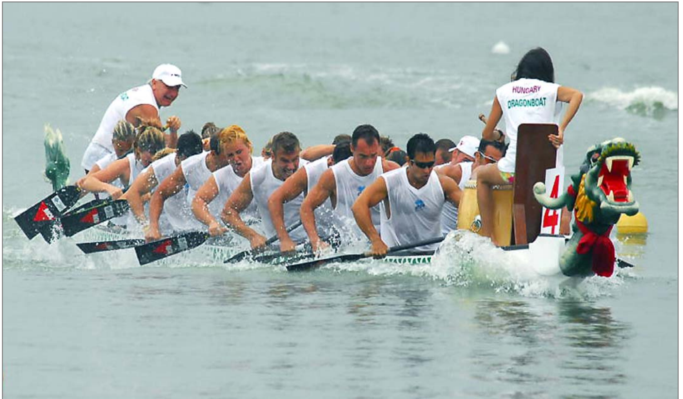
World Championships Dragonboat 2006, Hungary, Winner in all Mixte races