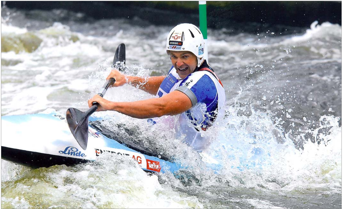
World Championships Slalom Racing 2006 Prague, K1 men