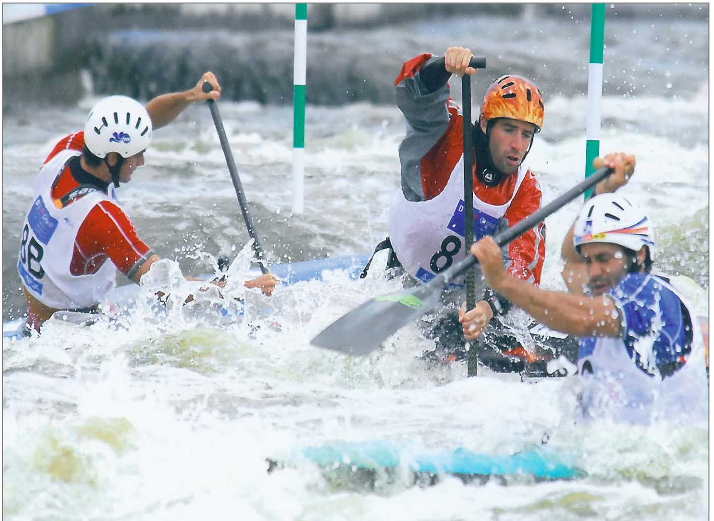
World Championships Slalom Racing 2006 Prague, C1 Team