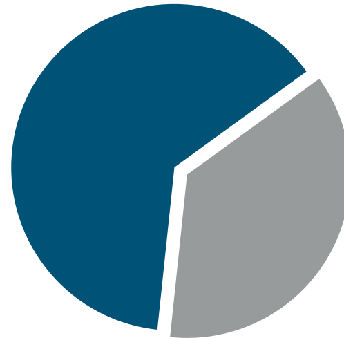
KU Pharmacy Graduates