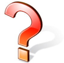
Don't know / refusal 38%