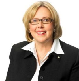
Elizabeth May 5%