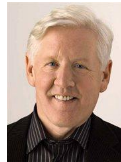
Bob Rae 12%