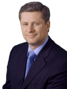
Stephen Harper 25%

Over a quarter of Canadians (25%) think Stephen Harper would make the best Prime Minister of Canada, followed by Thomas Mulcair (20%).