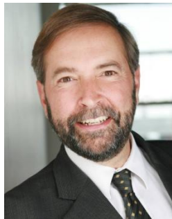
Thomas Mulcair 20%