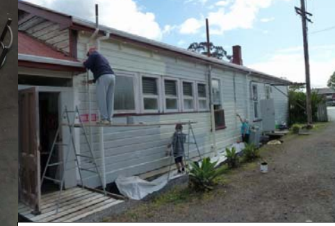
Rodger Toplis, Jill Toplis and Ninni Smyth attack the back of the station