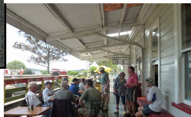
Day 1—Cuppa time for some of the "team"