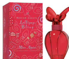
Lollipop Bling Mine Again EDP 30ml spray by Mariah Carey £14.99 at The Fragrance Shop