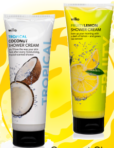
Coconut Shower Cream and Lemon Shower cream £1 each from Wilkinson's

Refresh and invigorate after a hot summer's day and keep your skin moisturised with fabulous beauty products available at stores throughout the Pentagon.