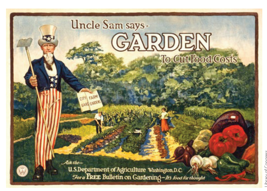
U.S. government social marketing poster from 1917.

For degrowth to succeed, effective communication will be needed across many sectors of society, from the Internet and the classroom to the voting booth and the living room. But the benefits to be gained from degrowth—and the more-equitable distribution of social benefits that would result—are great: more-equitable societies have less violent crime, higher literacy levels, lower overweight levels, and lower teen pregnancy and incarceration rates. Degrowth can help solve a variety of societal woes while lessening the likelihood of environmental collapse.