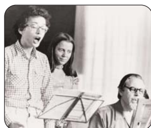
Rene Jacobs and Alfred Deller

recordings became key in establishing harmonia mundi as a force in music from these periods.