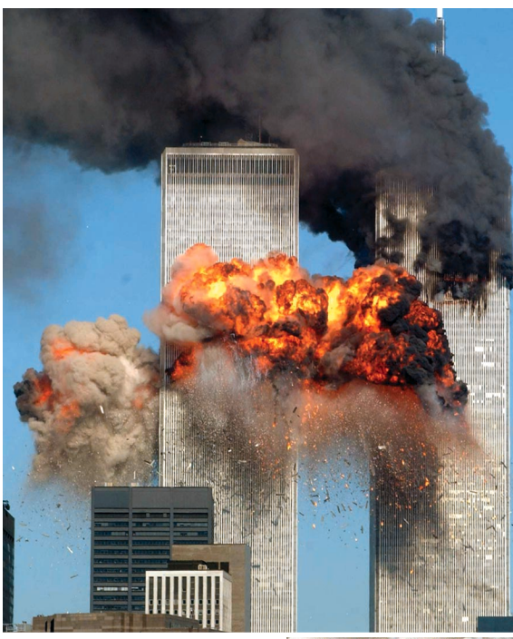
Figure 1. Flames and debris exploded from the World Trade Center south tower immediately after the airplane's impact. The black smoke indicates a fuel-rich fire.

In combustion science, there are three basic types of flames, namely, a jet burner, a pre-mixed flame, and a diffuse flame. A jet burner generally involves mixing the fuel and the oxidant in nearly stoichiometric proportions and igniting the mixture in a constant-volume chamber. Since the combustion products cannot expand in the constant-volume cham-