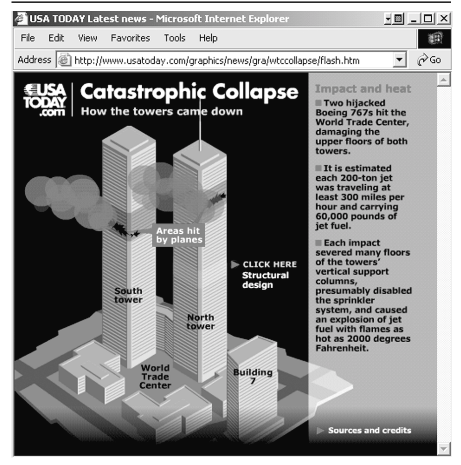
Figure 4. A graphic illustration, from the USA Today newspaper web site, of the World Trade Center points of impact.