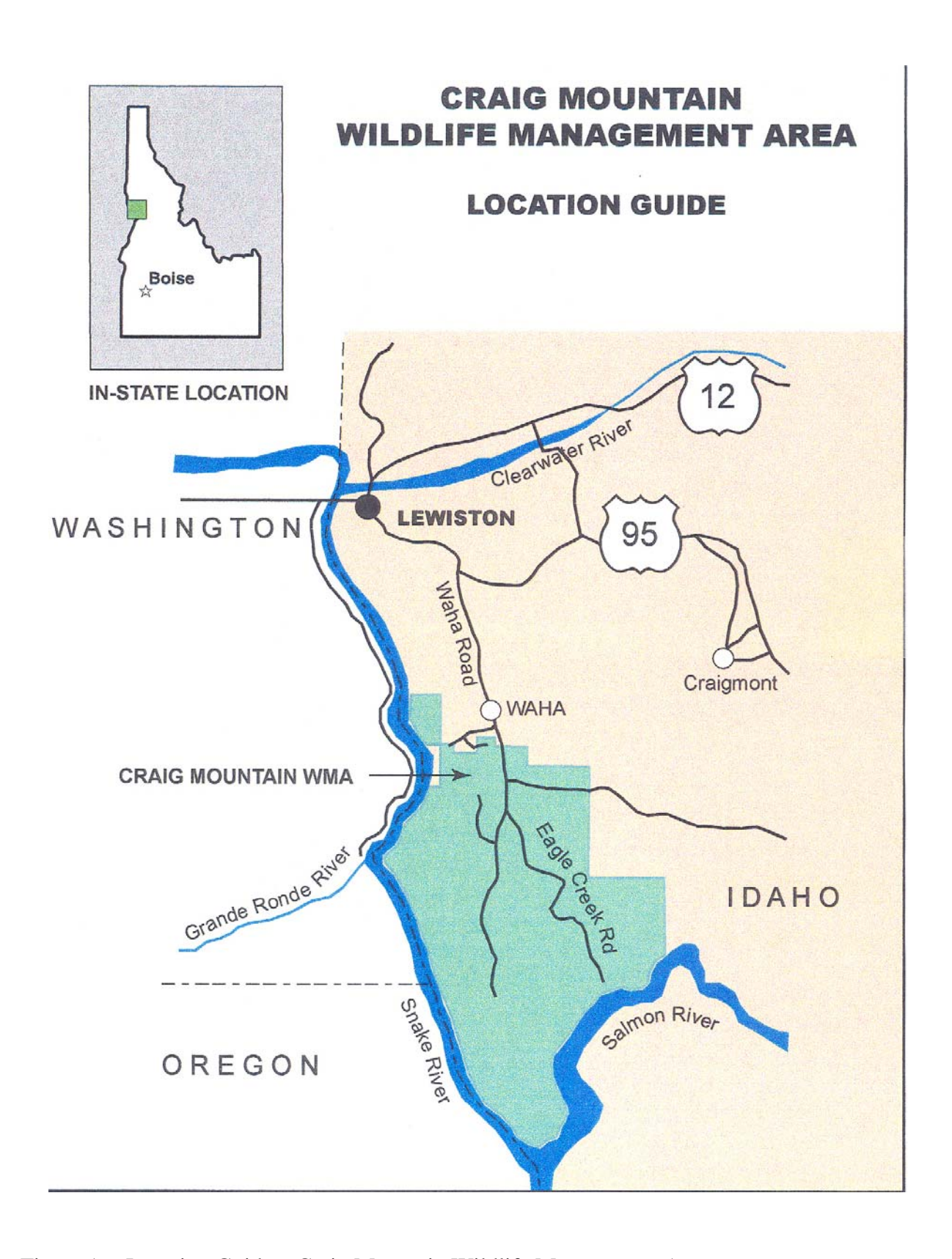
Figure 1. Location Guide – Craig Mountain Wildlife Management Area.