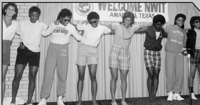
The '85 Lady Gator team reached the finals of the NWIT.

Feb. 20, 1994 — UF tops South Carolina 80-68 to conclude its home season with a perfect 14-0 record, the program's first undefeated home slate.