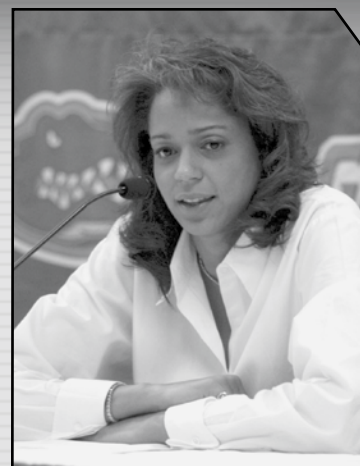
Carolyn Peck became the eighth head coach of the Gator women's basketball team.