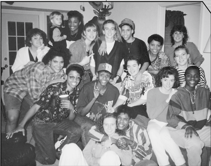
The 1993 Lady Gators became the first UF team to earn a trip to the NCAA Championship.