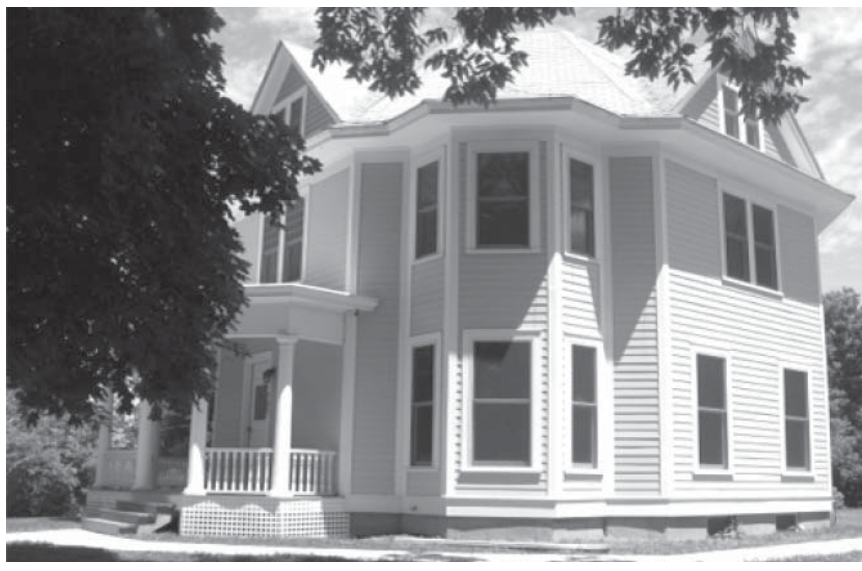
The Gallup House, Jefferson, Iowa