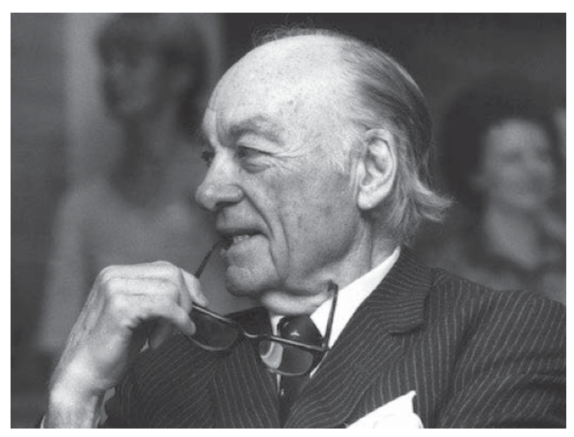
George Gallup in 1978