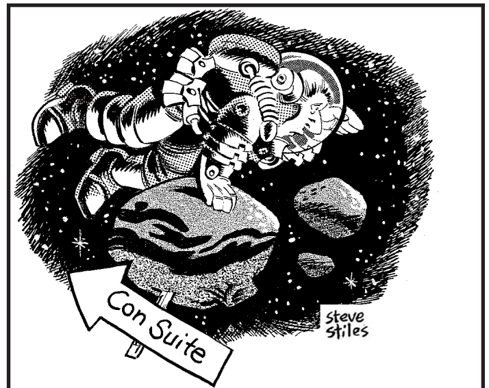
Artwork courtesy of Steve Stiles

Parties are an integral part of the night life at BayCon. If you want to throw a party at BayCon 2012, send email to parties12@baycon.org for information about rooms on the "party floor" of the hotel, along with the hotel's rules regarding parties at BayCon. Party rooms are available for every evening of the convention.