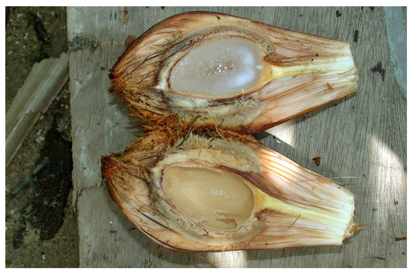
Fig. 2. Cross section of a fruit, showing the edible, soft endosperm.

The nipah palm can grow up to 10 m tall (Tomlinson, 1986; Keng, 1998; Dransfield et al., 2008). It differs from most palms in the lack of an upright stem, but instead, has thick, prostrate, rhizomatous stems that branch dichotomously underground (Fig. 3). A new plant grows out vegetatively from each branch, often creating extensive pure stands that are closely packed. The terminal shoot supports a cluster of erect, pinnate leaves, of which the alternating leaflets are lanceolate and numerous (30–40 per leaf). It is monoecious and the flowers are dimorphic. The female inflorescence is globular while the male inflorescence is catkin-like (Fig. 4b). Pollination appears to by a variety of insects and wind (Hoppe, 2005; Fig. 5), with drosophilid flies probably playing a more dominant role (Uhl & Moore, 1997; Tomlinson, 1986). Each fertilized flower develops into a fibrous, chestnut-brown fruit and forms a large spherical infructescence upon maturation. The heavy weight of the infructescence causes the inflorescence stalk to droop, but it is supported by seawater during tidal inundation (Fig. 6). Growth of the plumule while on the parent plant pushes the fruit away from the infructescence to cause abscission and these buoyant fruits are subsequently water dispersed.