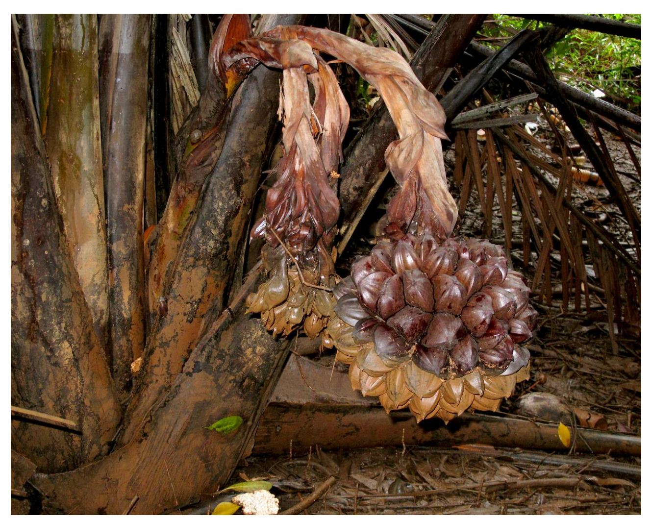
Fig. 6. Drooping inflorescence stalk bearing the fruits at Berlayar Creek. Note the high tide level marked by the mud at the lower portions of the infructescences.