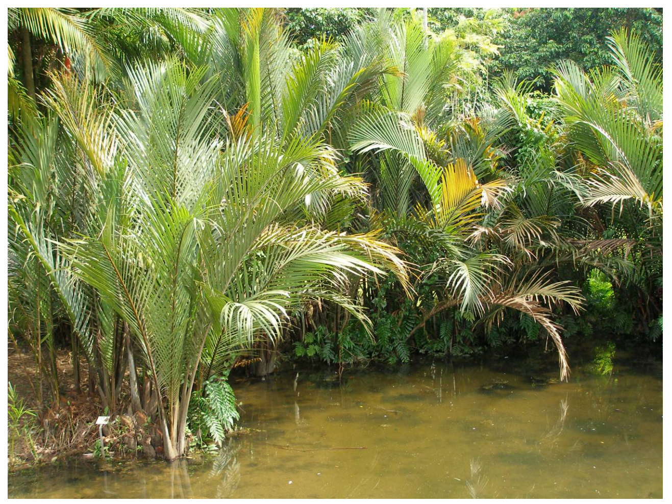
Fig. 9. Cultivated plants in Eco-Lake, Singapore Botanic Gardens. (Photograph by: Ang Wee Foong).

Pulau Ubin (Chek Jawa), restricted military training areas (Pulau Tekong, and the Western Catchment Area) and a nature reserve (Sungei Buloh Wetland Reserve), are generally safe from development. However, it must be noted that ongoing reclamation work in Pulau Tekong may affect several known nipah palm populations along the northern coastline, according to future development plans drawn up (URA, 2008). On a positive note, those at Lim Chu Kang, and Berlayar Creek will be protected in the near future after announcements of an expansion of Sungei Buloh Wetland Reserve that will encompass the Lim Chu Kang mangroves (Tan, 2008), and the construction of a mangrove boardwalk through Berlayar Creek as part of the Singapore Park Connector Network programme (Liaw, 2008). The widespread local distribution and broad ecological amplitude of this nationally vulnerable plant, including occurrences within the parks and legally protected nature reserves, should ensure the nipah palm's continued survival in Singapore.