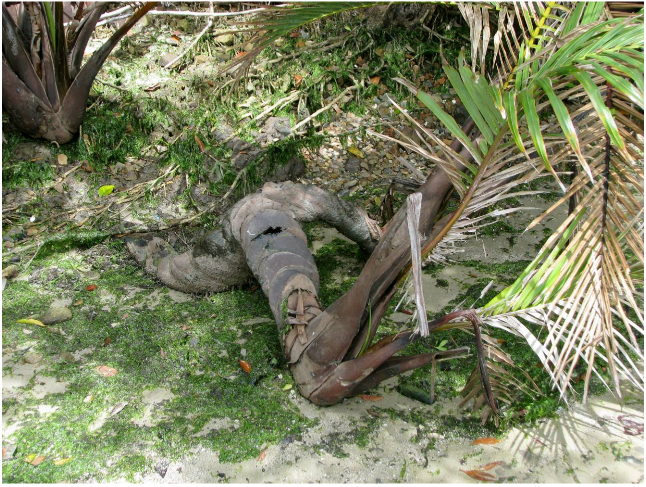
Fig. 3. Forked, branching rhizomes exposed after erosion at Chek Jawa, Pulau Ubin.