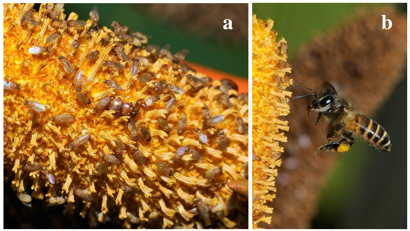
Fig. 5. Possible pollinators of Nypa fruticans on a male inflorescence at Woodlands Town Garden: a, beetles; a, and the Asian common honey bee ( Apis cerana ).