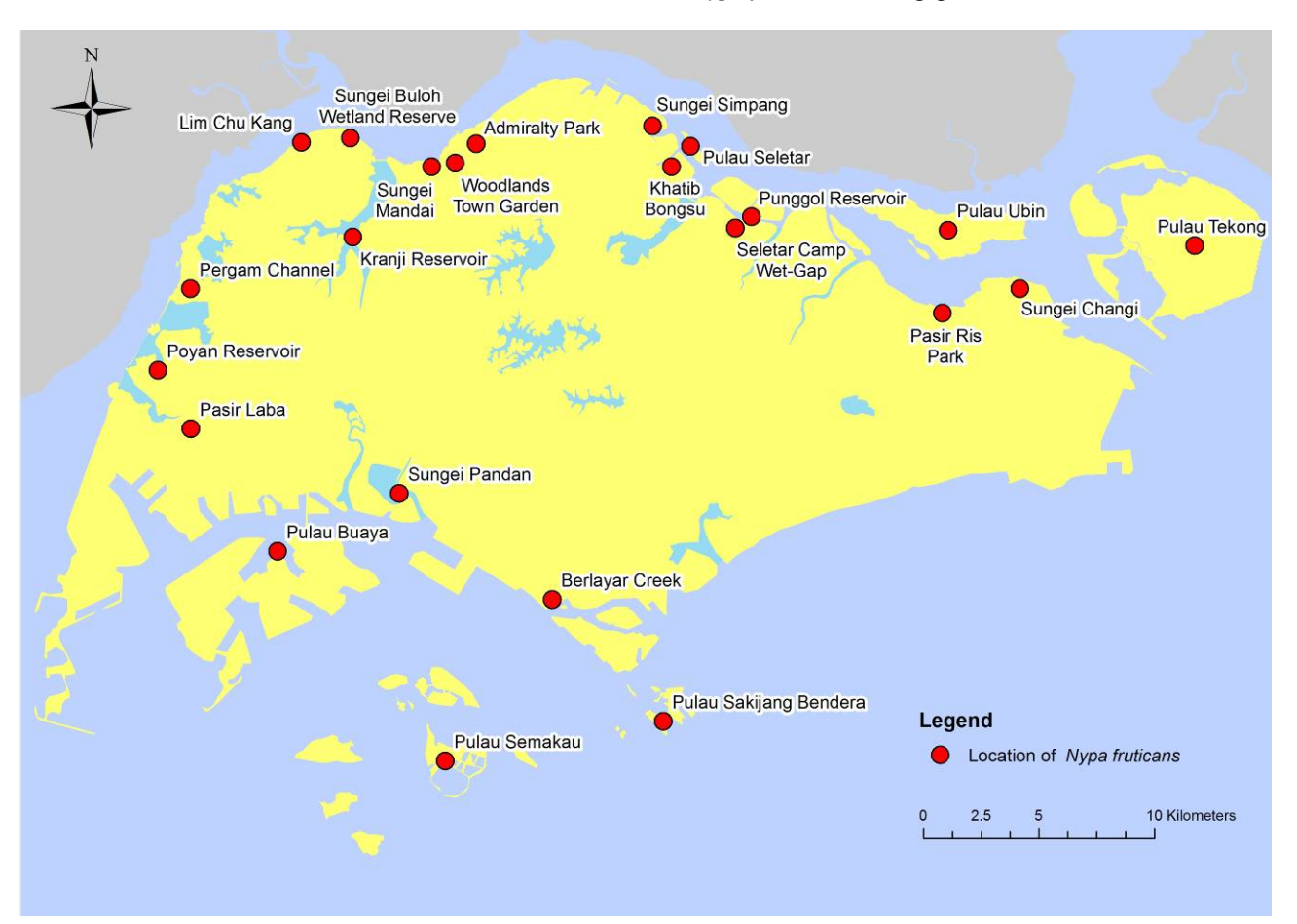
Teo et al.: Status and Distribution of Nypa fruticans in Singapore