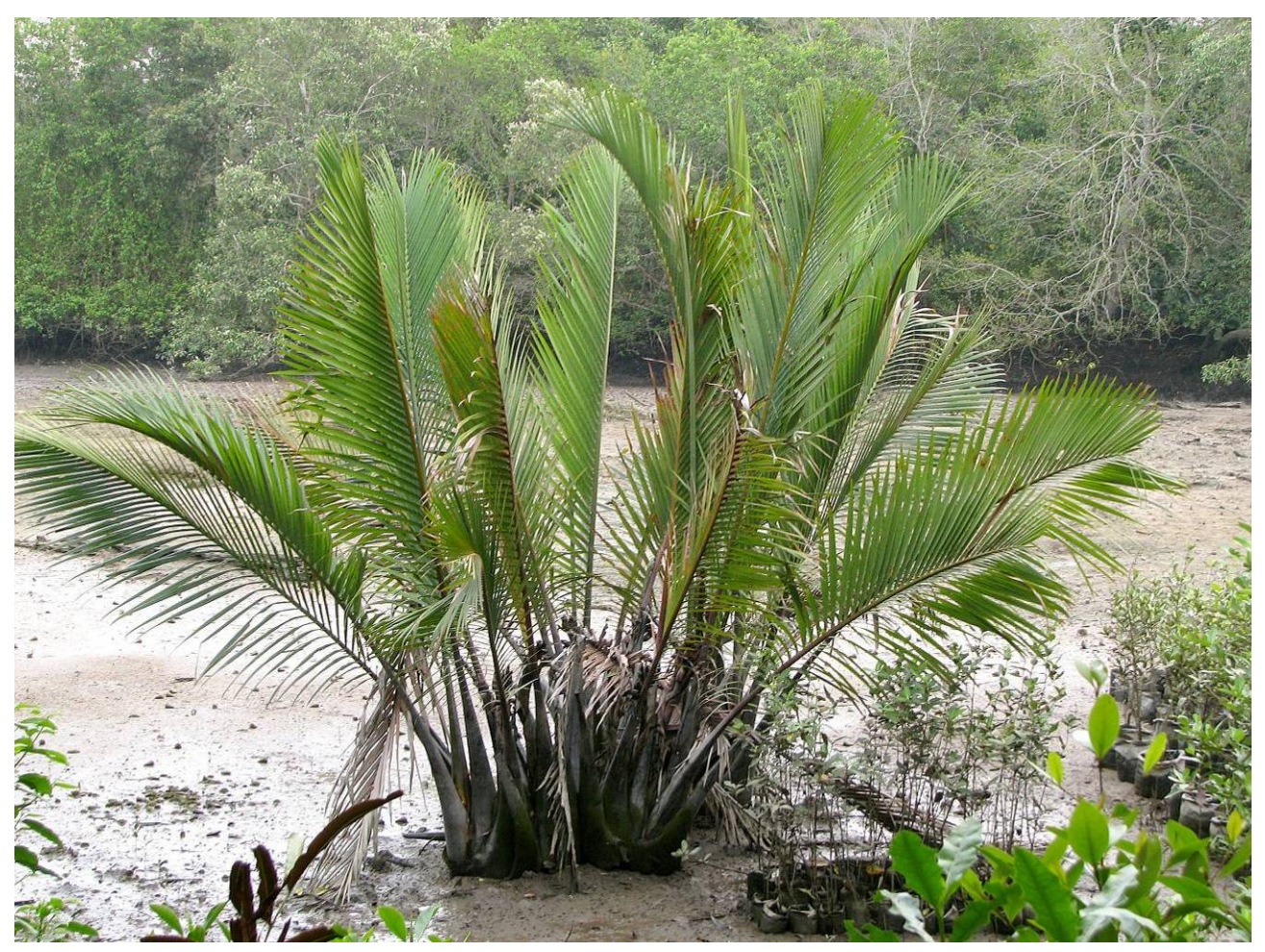
Fig. 1. The nipah palm, Nypa fruticans, in Sungei Buloh Wetland Reserve.

The genus Nypa is monotypic, with Nypa fruticans being its only species, and is placed in its own subfamily, the Nypoideae (see Dransfield et al., 2008). It is one of the most ancient angiosperms and probably the oldest species of palms (Päiväke, 1996). Fossil records of its pollen, fruit, leaf, flowering parts, leaf epidermis and root have been found (Dransfield et al., 2008), the oldest dating back to the Upper Cretaceous period, 65–70 million years ago (Gee, 2001).