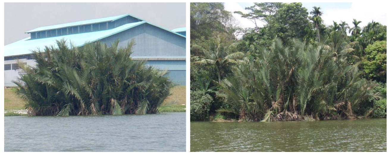
Fig. 8. Nypa fruticans stands along the Kranji Reservoir.

to thrive in an exclusively freshwater environment as well. It grows easily in freshwater conditions in the tropics (Riffle & Craft, 2003), and a cultivated colony has been established in Bogor Botanic Garden, Indonesia for at least a century, while more recent cultivation of this palm has also taken place in the Palmetum in Townsville, Australia, the water lily pond in a tropical glasshouse in the Royal Botanic Gardens, Kew, UK (Jones, 1995) and in Singapore, this species been successfully established at the Eco-Lake in the Singapore Botanic Gardens (Fig. 9) and at Kent Ridge Park.