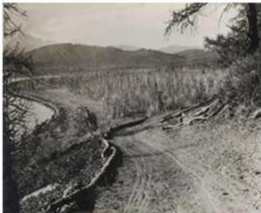
Siberia, Altai. The road leads north and Northeast, June 11, 1911