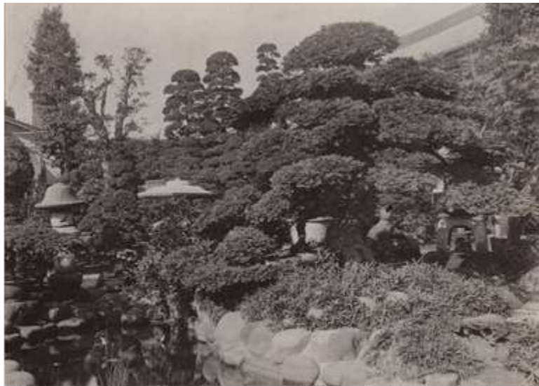
Retinospora obtusa, Yokohama, Japan. Conifers of various species, dwarfed, trained and shaped in all forms, some representing several centuries of painstaking work. In the compound of the Yokohama Nursery Company, Nakamura, October 11, 1916