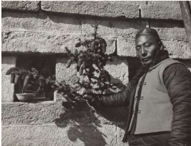
February 26, 1908