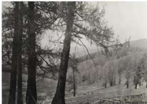
Siberia, Altai. As we march further north we pass a rolling country, June 9, 1911