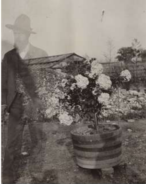
Viburnum macrocephalum . Grown in tub; could be utilized very well as a decorative plant by our florists. It does not stand any great cold. Shanghai, May 4, 1908, photograph by Frank Meyer [photograph is double exposed and includes an image of Meyer]

In 1914, in Plantae Wilsonianae , Alfred Rehder and Ernest Henry Wilson would describe and name a new species of spruce, Picea meyeri based on the specimen Meyer collected on February 25 th 1907. The April 24, June 1, and February 26 images were all then identified as Picea meyeri and the Harvard University Herbaria holds the holotype , the specimen used by Rehder & E. H. Wilson to identify the species.