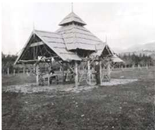
Russian Caucasus. Tea house on an imperial estate, Chakva, where one may order a cup of tea, February 23, 1910

As of 2012, most the Arboretum's holdings of Meyer's photographs of central Asia have not been digitized. However, although it may not be a complete record, a searchable list is available of Meyer's images taken in parts of Russia, Siberia, Mongolia, Turkestan, and the United States and includes date, country, plant name, and description of the image. The description of the image usually includes plant name(s), more information about the plant(s), Meyer's observations on the subject, a detailed location where the picture was taken, and its date. The following eight images are a representative sampling of Meyer's images of central Asia.