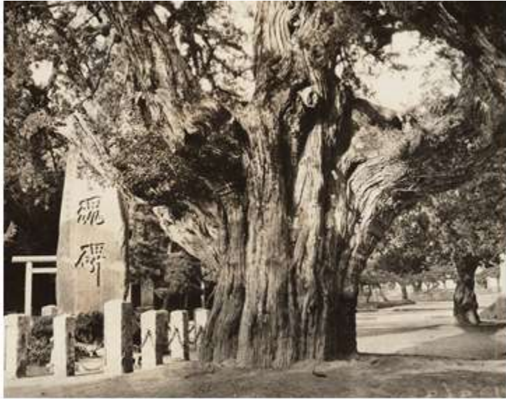
Juniperis chinensis. Kamakura, Japan. A remarkably large specimen of Chinese juniper in the grounds of the Kenchoji (?) temple, many centuries old. September 15, 1915