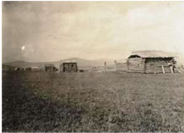
Siberia, Alati, The Russian settlement of Ak-Selan, June 6, 1911