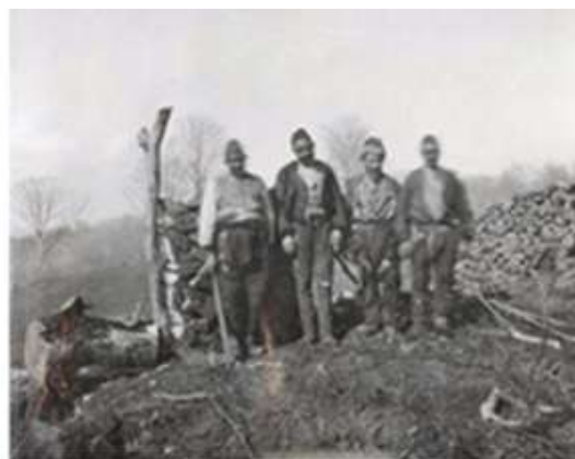
Russian Caucasus, A motley crew of woodchoppers. These men are mainly Turks, hardworking and sober, but they do not earn much over 60 to 80 RopECKs per day, Chakva near Batorim, February 23, 1910