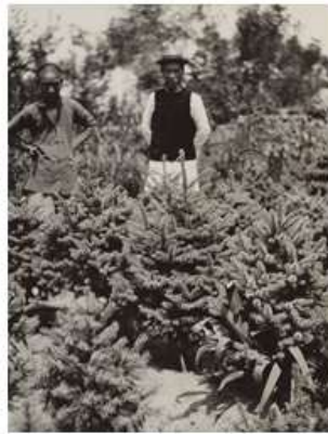
June 1, 1907