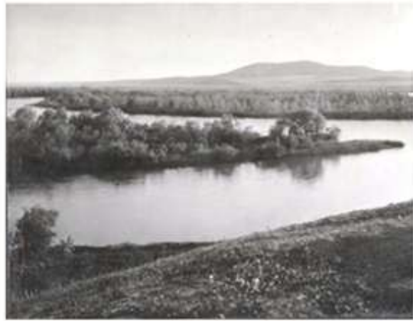
Two Views: Siberia, Irtysh River. The beautiful scenery along the Irtysh River. With the irrigated vegetable gardens of Krasnoyarsk lying at the foot of the cliffs, this is an arid country and it is only where water is in reach of the roots that one finds trees of any size. September 29, 1911, photographs by Frank Meyer