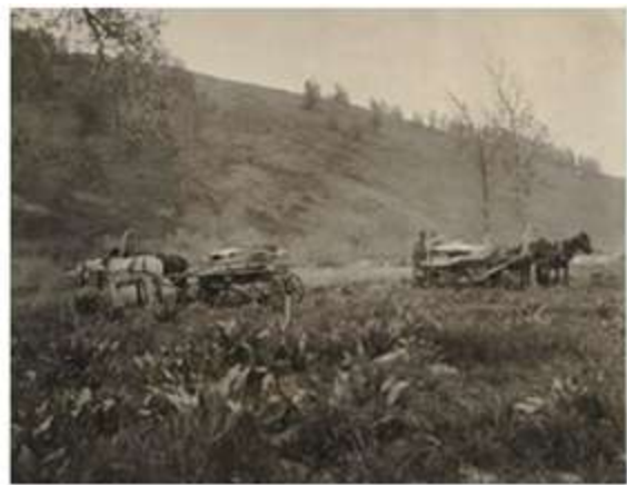
Siberia, Alati, Our camping place near some tall larches, June 7, 1911, photograph by Frank Meyer