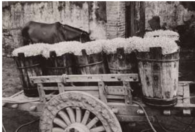
Phaseolus aureus . Peking, China. A cart full of tubs of bean sprouts, produced by the humble mung bean. These bean sprouts are eaten as a vegetable, when scalded, and they are a very tasteful product when served cold as salad with some soy-bean, vinegar and oil sprinkled over them. Sixteen or seventeen catties of dry beans supply from fifty to sixty catties of sprouts. June 28, 1913, photograph by Frank Meyer

The Arnold Arboretum's Frank N. Meyer photograph collection consists of approximately 1,600 various sized black and white photographs mounted on boards, often with several images mounted together on one board, and 150 small, various sized, black and white sleeved photographs. The mounted images include Meyer's detailed descriptions on the verso. The images are filed in the Arboretum's historic photograph collection with photographs of specific plants filed alphabetically by genus and species and general subjects filed alphabetically by country then by local place name. In 2005, the Arboretum digitized 1,344 Meyer's images of eastern Asia. Information on how to search for and view Meyer's images and their metadata in the Botanical and Cultural Images of Eastern Asia, 1907-1927 collection.