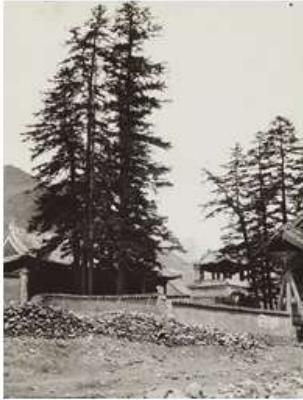
April 24, 1907