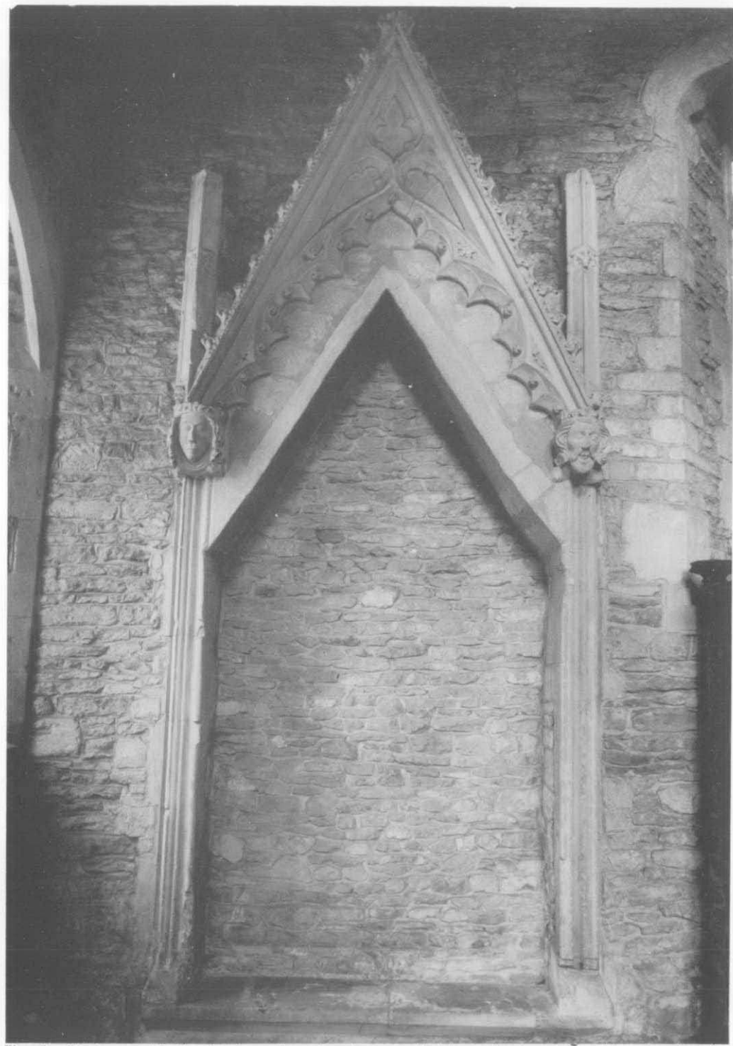
Plate 3. Bampton parish church: tabernacle against the east wall of the north transept chapel, interpreted as the remains of St. Beornwald's shrine (1984).