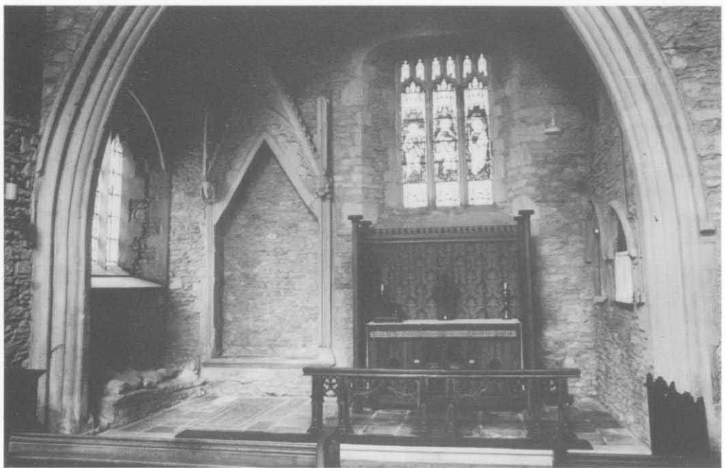
Plate 2. Bampton parish church: chapel on the east side of the north transept, looking east (1984). The monumental brass indent can be seen on the floor in front of the tabernacle.

William Wode, clerk of Bampton, bequeathed his soul 'to God, to our lady, Sent Barnwald, and to all the seintes of hevyn'. If the evidence is sparse, its message is clear: the cult was quietly observed, and the shrine maintained, until the eve of the Reformation.