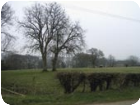
View from Church Farm