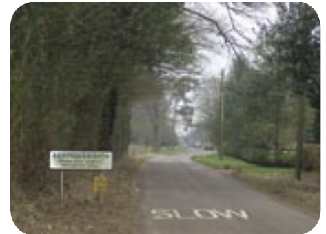
View into Conservation Area

The Borough Council provides grants for various types of work. These include Historic Building Grants, Environment and Regeneration Grants, and Village and Community Hall Grants. Leaflets are available explaining the purpose and criteria for each grant. Please contact the Council for further information on any grant.