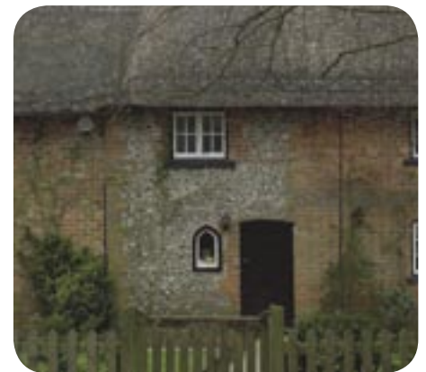
Beech Tree Cottage

There is a considerable variety of trees in the village, with ash the most common. Lime is prominent in the centre of the village within the curtilage of the Old Vicarage and Hallam, at the junction of the main thoroughfare and Cross Lane. There are six large beech trees around the Village Hall, plus several oak, hawthorn, hazel and beech on the Woodhay Road. The combined effect of all these deciduous trees is an impressive leafy backdrop to the village which emphasises its rural character, particularly in the summertime. Other species of tree present in the village include horse chestnut, sweet chestnut, bird cherry (village