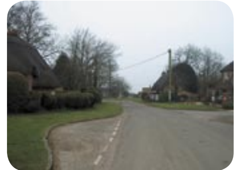
View south west through Conservation Area

Recent records are more detailed, indicating that the population remained small during the 19th Century. The inhabitants of Ashmansworth were mainly labourers who spent much of their lives in the village, and took spouses from the neighbouring parishes. On 12th May 1802 the "manors of Ashmansworth and the rights of free warrant therein" were sold by the Bishop of Winchester to the first Earl of Carnarvon.