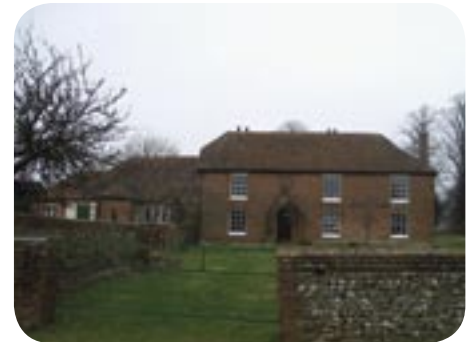
Lower Manor Farm