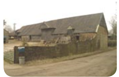
Steeles Farm Barn

The majority of roofs are in plain peg or nib clay tiles, and are orange/red in colour, although there are a few examples of slate being used. Windows are usually timber, with some Georgian/Victorian panelled doors on later buildings.