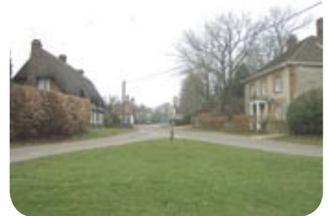
View from War Memorial

Notable sections of brick and flint walls survive at Ashmansworth House and Steeles Farm. At Church Farm there is a good example of knapped flints re-used to form a wall. The barns at Lower Manor Farm, Steeles Farm and Ashmansworth Manor all date from the 18th century and have group value architecturally, as well as individual historic merit.