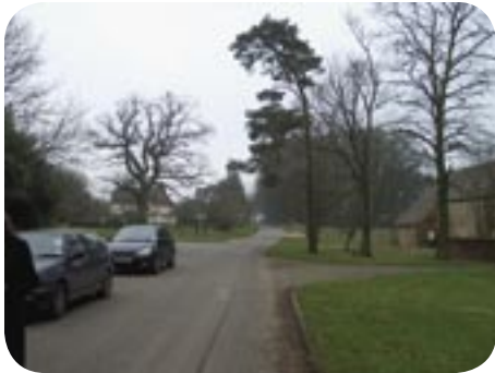
View out of Conservation Area