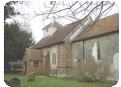
St James Church

Lower Manor Farmhouse, with its Dutch flat arches to the ground floor and Gothic gabled porch, is a particularly distinctive building, dating from the early 19th century. Located at the southern edge of the Conservation Area, and isolated from the main settlement core, the building is prominent in views towards this part of the Conservation Area. The farmhouse is a two-storey, Grade II listed building of red brick in English bond with blue headers. The Gothic gabled porch was added in 1878. The brick and flint barn and roadside walling are both protected as curtilage structures.