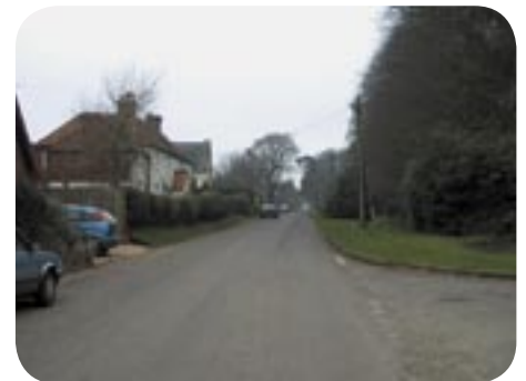
View north east through Conservation Area