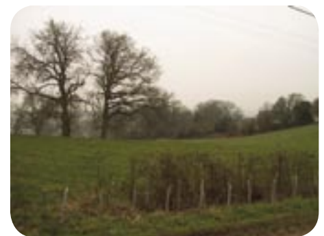
View from Lower Manor farm