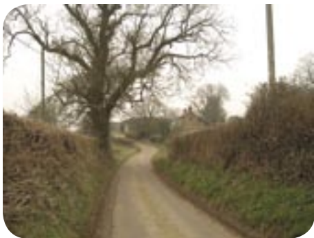
View towards Flint Wall Cottage

green), sycamore (north of the village), yew (churchyard), scots pine, spruce, larch, field maple, holly and evergreen oak (Church Farm).