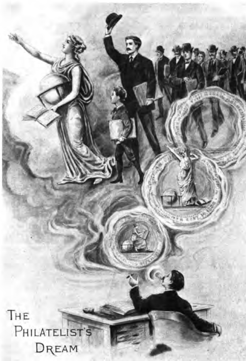
THE PHILATELIST'S DREAM

You have my assurance that, in reading through nearly 100 years of The American Philatelist , I have discovered some marvelously interesting articles that budding