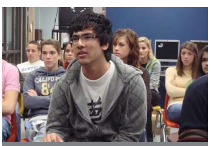
Your work went a LONG way to educating and inspiring us to view the world differently. I love hearing my students wanting to try to find

Our goal is to expand the Gateway to focus on many more global issues. On the horizon for 2009: examinations of climate change, India as a rising power, global food security, and oil in the Amazon.