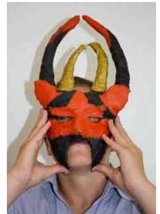
Benjamin Cullinane - 9CE