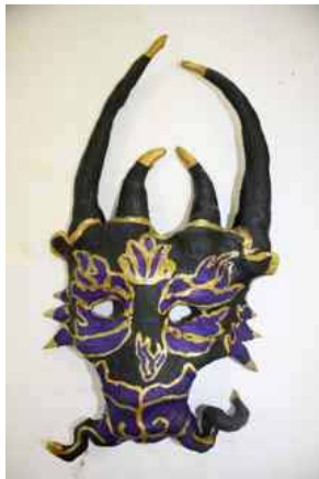
Oscar Boulger - 9CE