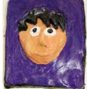
Rynz Yanez - 7R