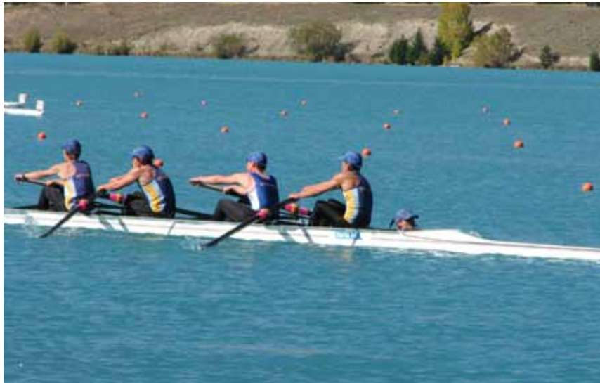
The U16 Four in the closing stages of their silver medal performance.