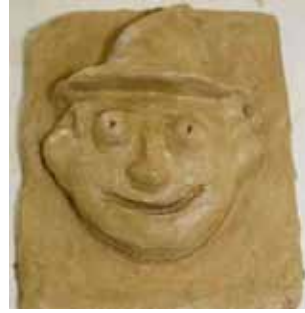
Caleb Spierings - 7B