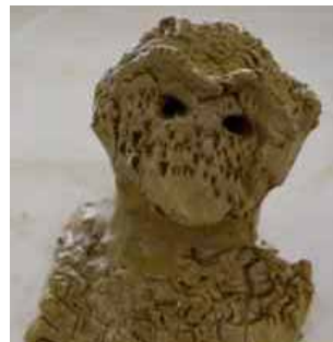
Jack Barr - 7B