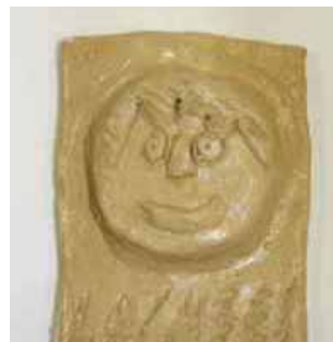
Lachlan Douglas - 7B