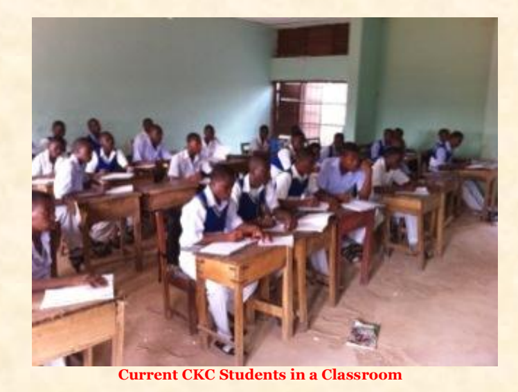
Floreat CKC- Primus