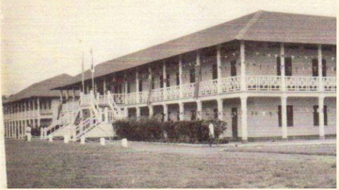
Majestic College Main Building, circa 1960