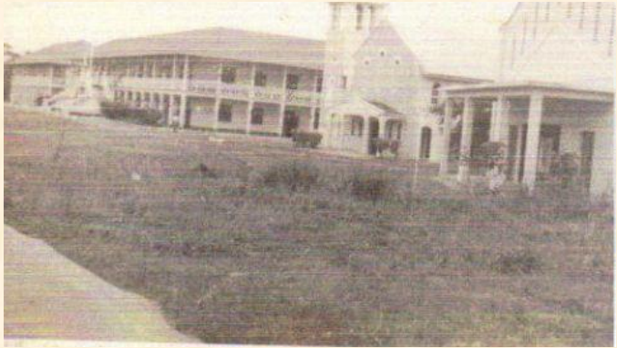
The College Hall and Chapel (foreground), circa 1960