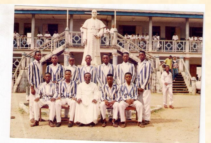
Post civil-war CKC students in college blazers The Way We Were