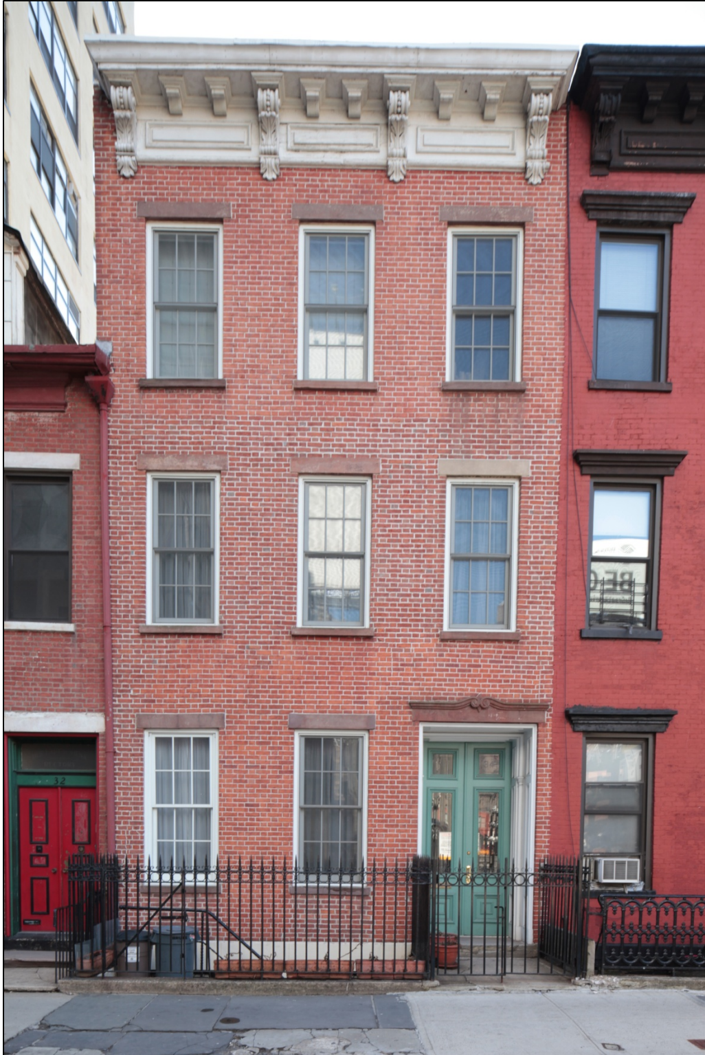
34 Dominick Street House 34 Dominick Street, Manhattan Block: 578, Lot: 63 Photo: Olivia T. Klose, 2011