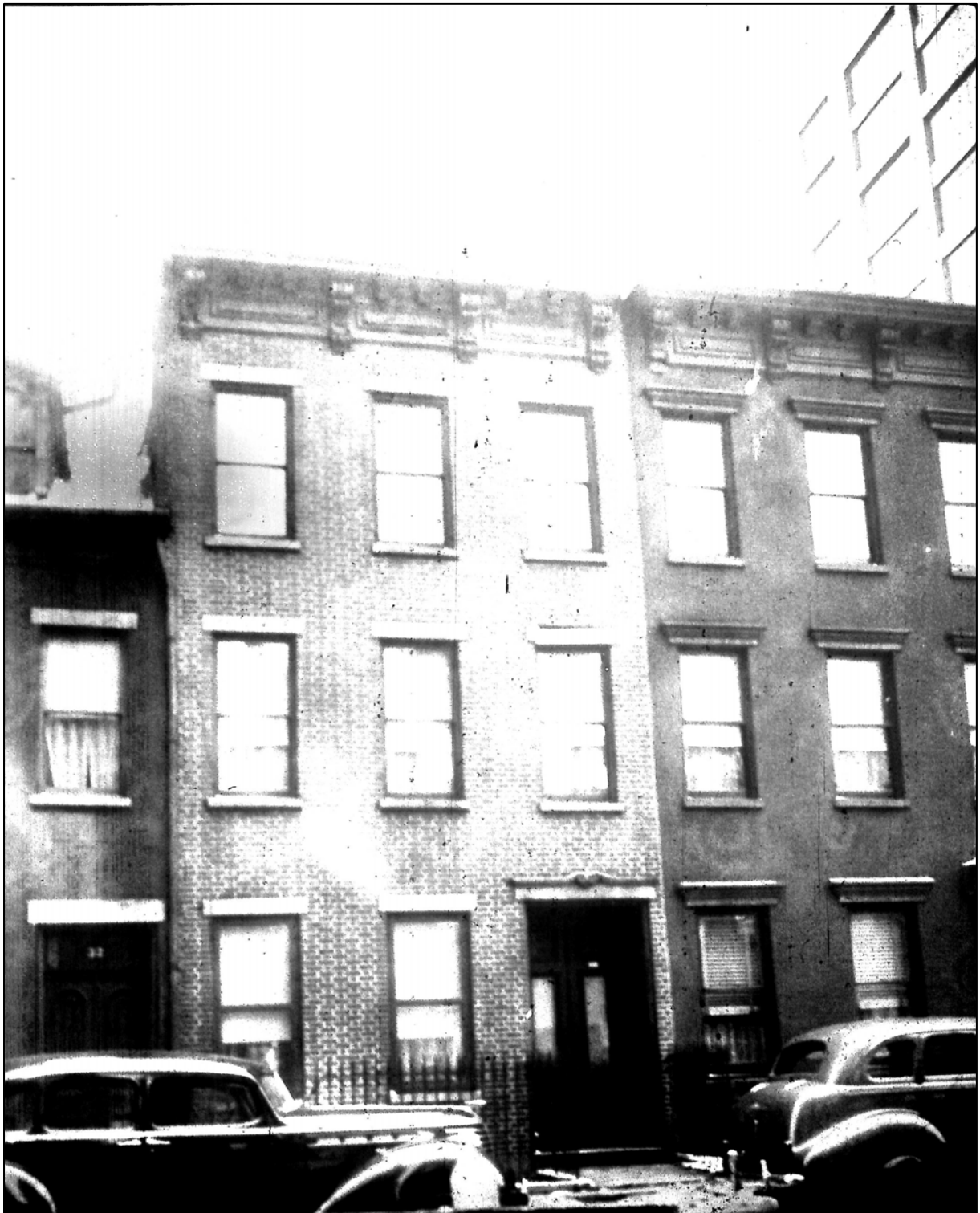
34 Dominick Street House NYC Dept. of Taxes (c. 1939), Municipal Archives