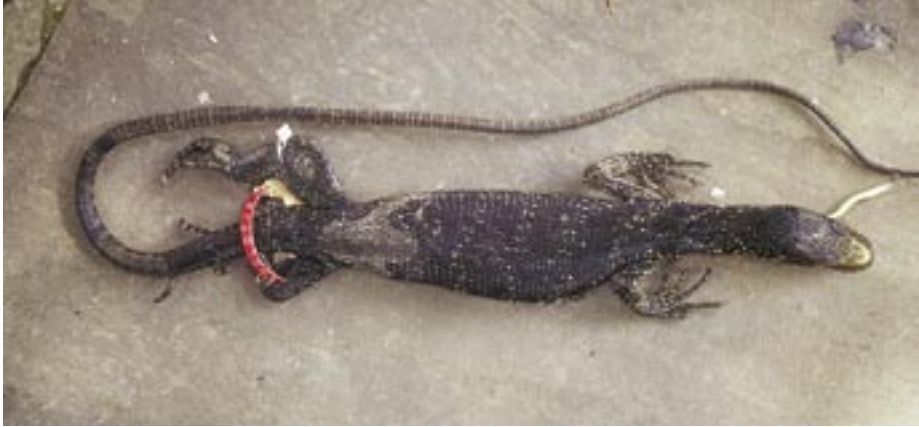
Fig. 1. Holotype of Varanus boehmei sp.n. (ZFMK 77837), dorsal view. Holotypus von Varanus boehmei sp.n. (ZFMK 77837), Dorsalansicht.