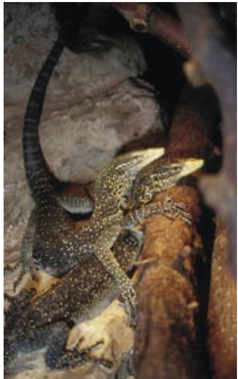
Fig. 4. Paratypes I and V of Varanus boehmei sp.n. (female below, male on top). Paratypus I und V von Varanus boehmei sp.n. (Weibchen unten, Männchen oben).