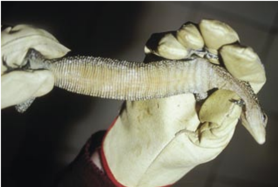
Fig. 6. Paratype IV of Varanus boehmei sp.n., subadult female, ventral view. Paratypus IV von Varanus boehmei sp.n., subadultes Weibchen, Ventralansicht.