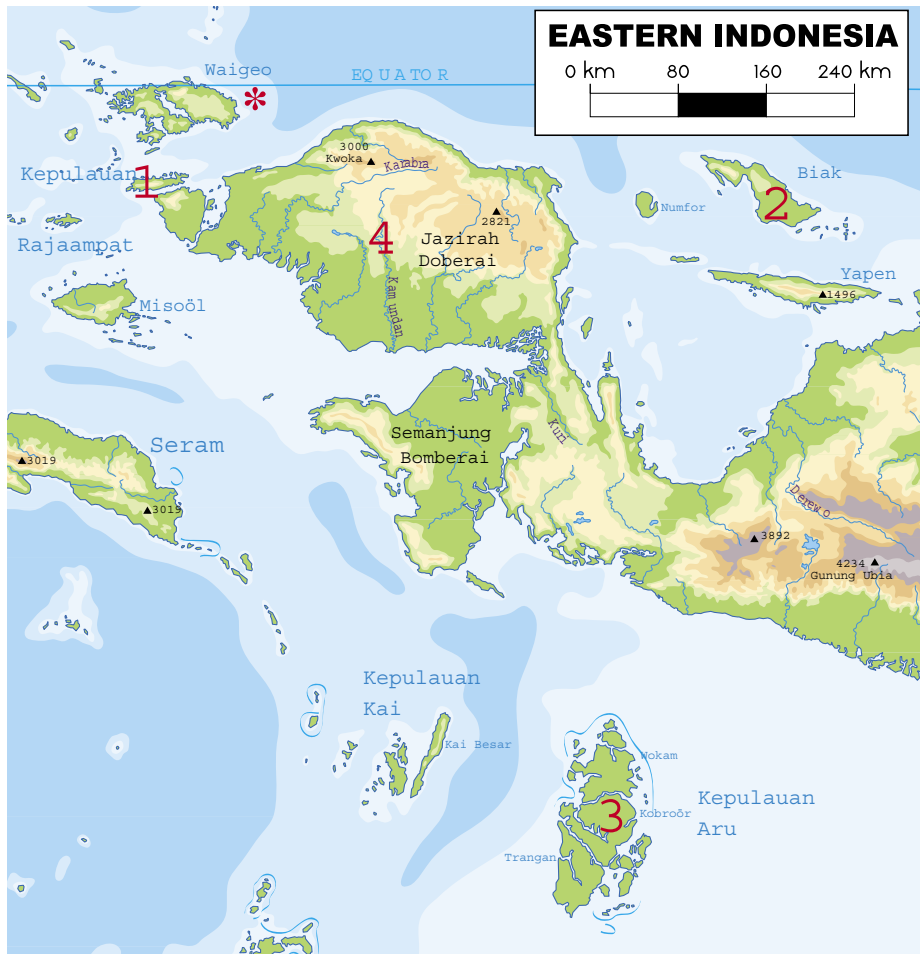
Fig. 7. Distribution of the species of the Varanus prasinus group in West Irian / Verbreitung der Arten der Varanus prasinus Gruppe in West Irian. * – Waigeo (type locality V. boehmei sp. n.); 1 – Batanta ( V. macraei ); 2 – Biak ( V. kordensis ); 3 – Aru ( V. beccarii ); 4 – Vogelkop ( V. prasinus ).

Derivatio nominis: I name the new species in honour of WOLFGANG BÖHME, Professor of Zoology (Zoologisches Forschungsinstitut und Museum Koenig, Bonn, Germany), long-standing president of the German Herpetological Society (DGHT), and one of the internationally best-known monitor-researchers. By analogy with the English derivate I suggest the German trivial name: “Goldgefleckter Baumwaran”.