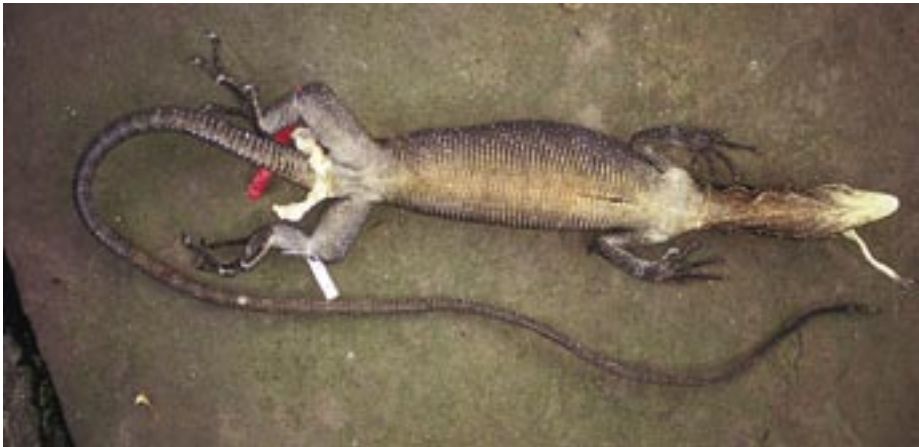
Fig. 2. Holotype of Varanus boehmei sp.n. (ZFMK 77837), ventral view. Holotypus von Varanus boehmei sp.n. (ZFMK 77837), Ventralansicht.

only rounded. Scales right in the middle of the chest strongly elongated. Ventral scales elongated. Dorsal side of limbs covered with weakly keeled scales. Ventral part of the limbs covered with mostly rounded scales.