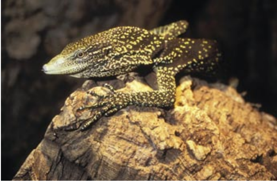
Fig. 5. Paratype III of Varanus boehmei sp.n., adult male. Paratypus III von Varanus boehmei sp.n., adultes Männchen.