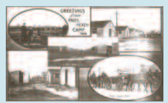
Above Postcard from 1916

Gallows for public hangings used to be situated at Gallowstree Bank by the A41, where it is believed that one of the last public hangings in England took place.