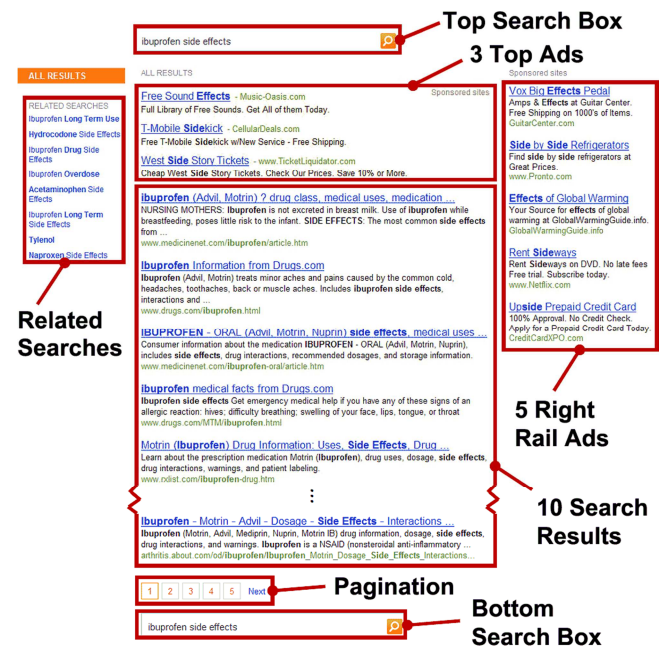
Figure 1. Recorded AOIs on an example SERP.