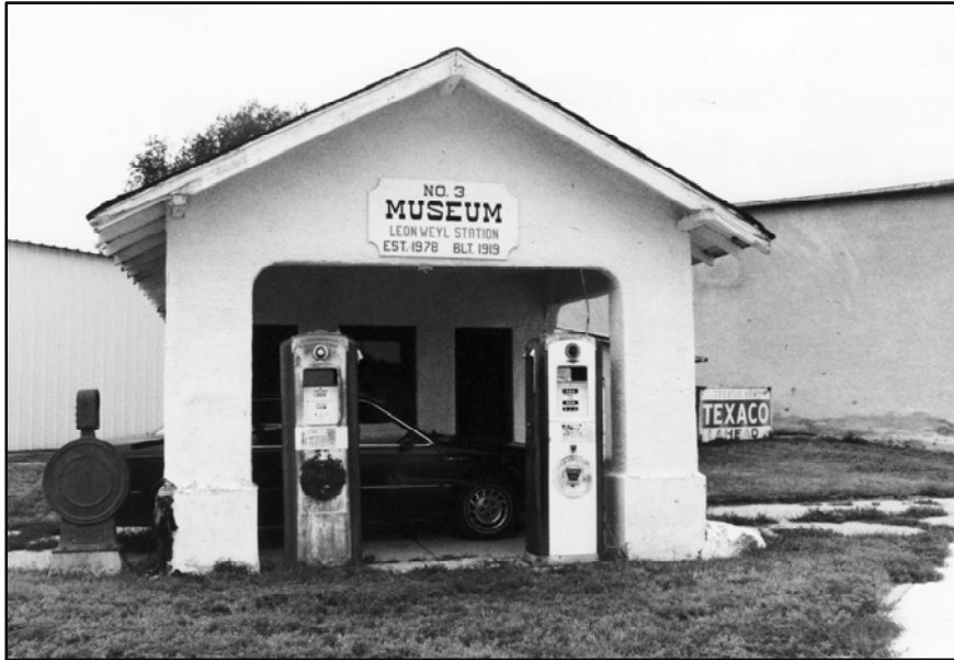
View of main façade, looking southwest