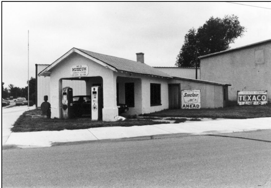
View of service station, looking south