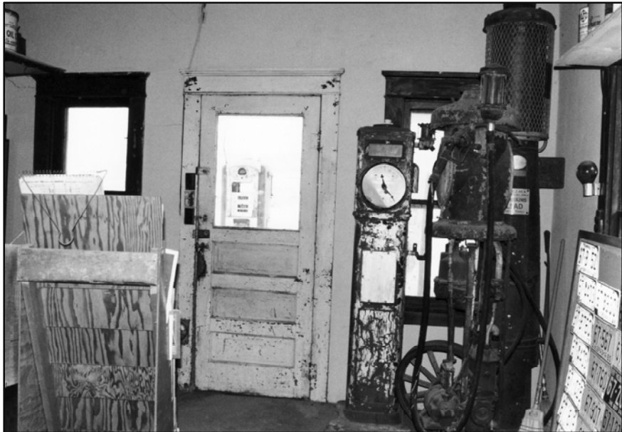
View of entry door from attendant's desk