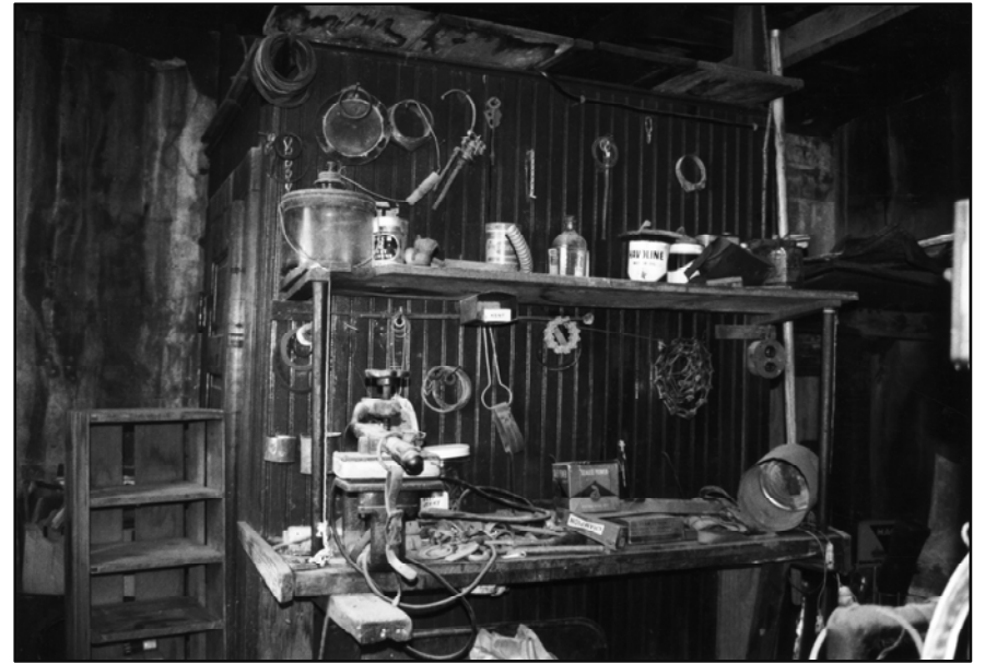
View of work bench, restroom door to left