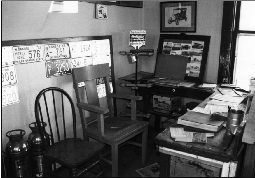
View of attendant's desk, looking southwest