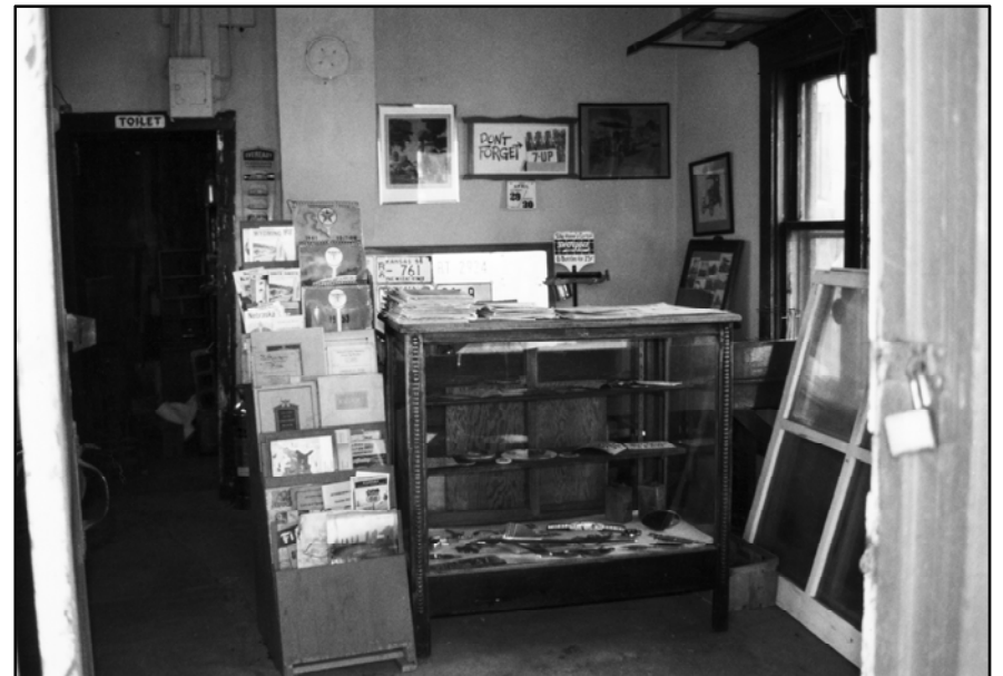
View of interior, glass display case at center, looking south