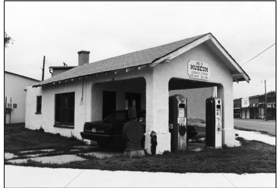
View of service station, looking west