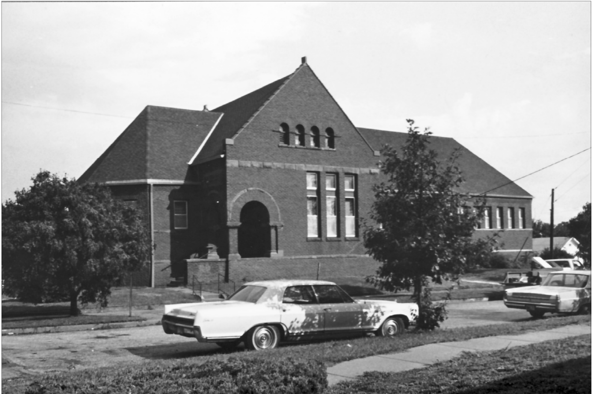
Overall view of library showing relationship to street, looking southeast. Photo by D. Murphy, 1975, NSHS (7509/2:27)