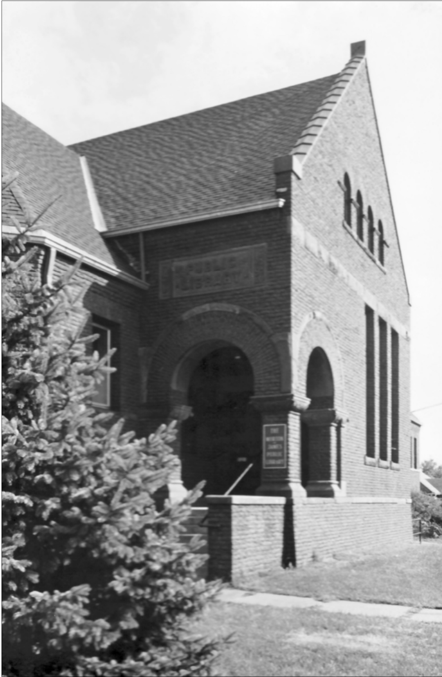
View of gabled entrance pavilion showing arched entrance porch at north-west corner, looking south-southeast. Photo by D. Murphy, 1975, NSHS (7509/2:31)