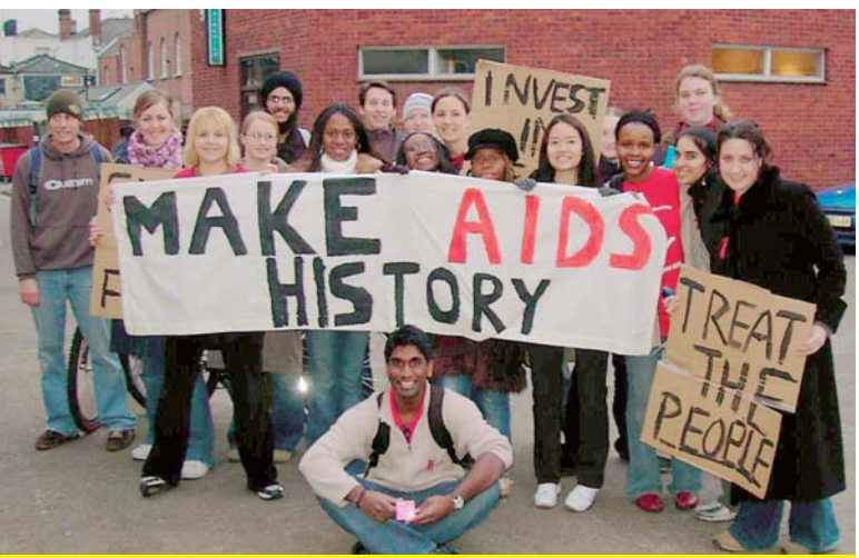
The Student Stop Aids Society make their views known on World AIDS Day.

A petition of 460 signatories collected by Southampton University Student Stop Aids Society was handed in to me on World AIDS Day (1st December). It called on the government to press for extra funding for HIV / AIDS, prioritise universal access to treatment and for greater investment in health care services in developing countries.