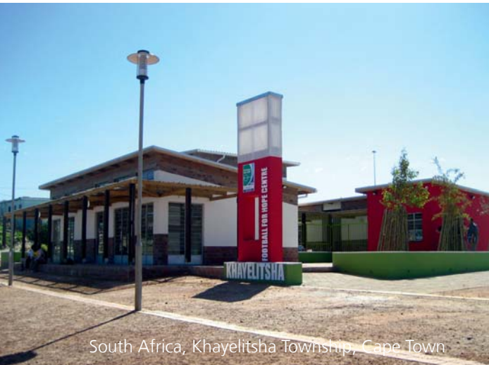
South Africa, Khayelitsha Township, Cape Town

"20 Centres for 2010" is the official campaign of the 2010 FIFA World Cup South Africa™. Its aim is to achieve positive social change through football by building twenty Football for Hope Centres for public health, education and football across Africa. The centres will address local social challenges that young people face in disadvantaged areas by helping to improve education and public health services. "20 Centres for 2010" will promote social development through football long after the final whistle of the 2010 FIFA World Cup™, leaving a tangible social legacy for Africa.