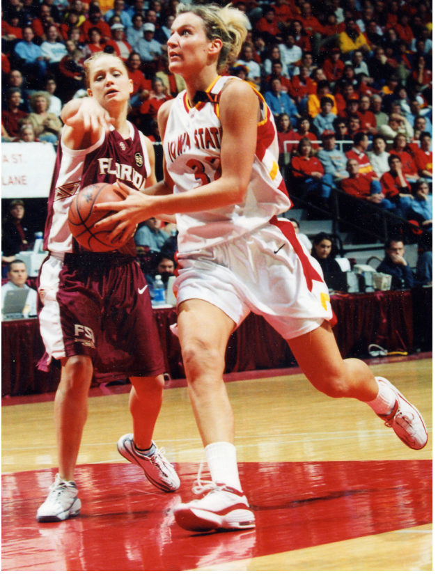
Angie Welle, Iowa State's all-time leading scorer with 2,149 points, was named a three-time All-American by The Associated Press in 2000, 2001 and 2002.