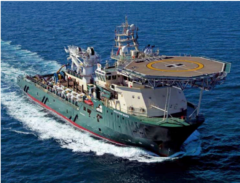
Plate 1 The ‘Greatship Mamta’

As the survey vessels uses dynamic positioning systems, anchoring will not be necessary through the survey area unless in the event of an emergency. Support vessels will not be required and no crew changes (via helicopter or return trips to port) are required for the duration of the survey. No at-sea refuelling is planned during the survey.