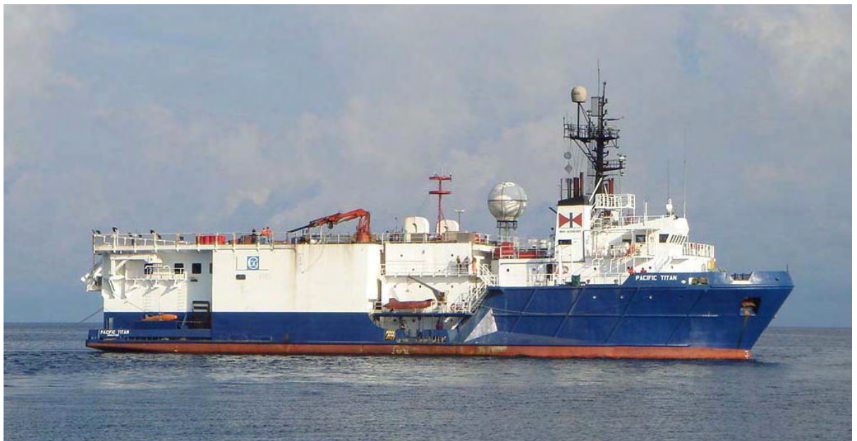
Figure 3: CGG Pacific Titan

Seismic activities are planned to occur on a 24hr operational basis and in sea-states of <4.5m. Streamer/gun deployment and retrieval are limited in sea-states greater than 4.5m.