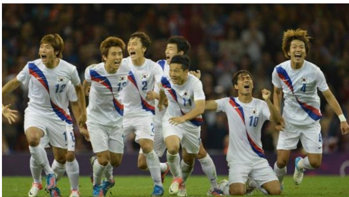
Left: Players of Republic of Korea celebrating after beating Great Britain on penalties at the men's quarter-final match on 4 August 2012 in Cardiff, Wales.