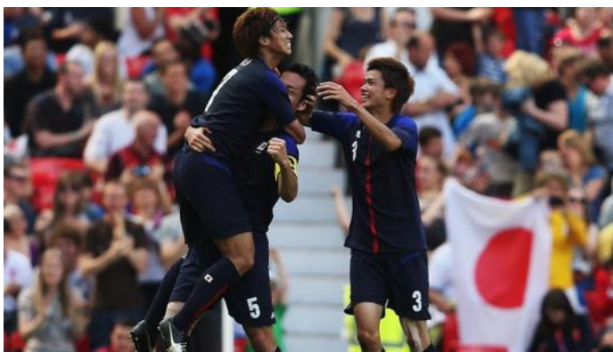
Left: Japan in action during their last win in the London 2012 tournament in the quarter-final match against Egypt when they won 3-0 at Old Trafford on 4 August 2012 in Manchester, England.