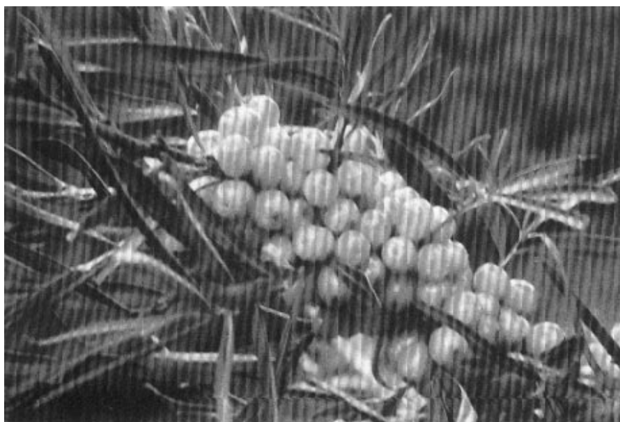
Fig. 1. Sea buckthorn berries.

are as high as 600 and 160 mg/100 g of fruit, respectively (Bernath and Foldesi, 1992). Its pulp and seeds contain essential oil important for its medicinal value, such as superoxide dismutase activity in mice, and it has enhanced the activity of NK cells in tumor-bearing mice (Chen, 1991; Dai et al., 1987; Degtyareva et al., 1991).