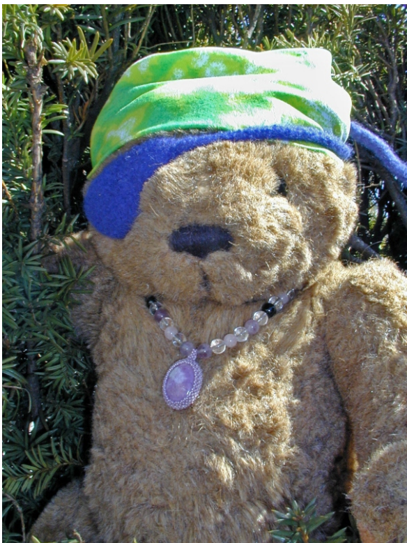
The Dread Pirate Earnest Sports a Stylish Small Eye Patch

Weave in ends. Felt by your preferred method. I like to put it in a zippered pillow protector with a load of towels or jeans on a Heavy Cotton, hot water wash cycle, with a bit of detergent. Stop the machine before the spin cycle, and inspect your eye patch. If not sufficiently felted, run the wash cycle again. Repeat as necessary until patch has reached desired size and felting. (I found I needed three cycles for the large patch, but only two for the small one.) (Cont'd next page.)