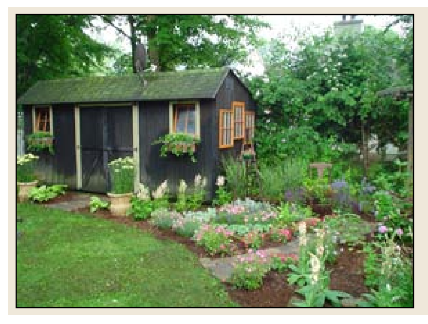
Color, window boxes and decorative accents can turn a forgotten shed into a charming backdrop.

Trees have a big impact on your homesite. Your goal is to take advantage of the best your trees offer and eliminate as many of the problem trees as you can. If you don't feel comfortable making an evaluation on your own, contact a certified arborist. You'll find an arborist via the International Society of Arboriculture web site.