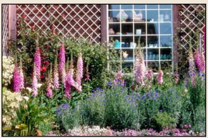
A simple white grid against weathered siding changes the character of the entire surface.

See all prefabricated wood or plastic (PVC) lattice options and sheet sizes online at Ryan Forest Products <a href="https://www.ryanforest.com">www.ryanforest.com</a>