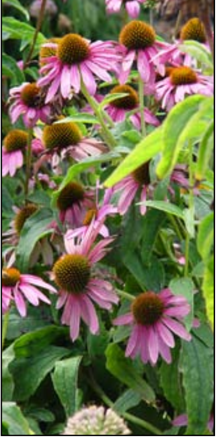
Echinacea purpurea Prairie Coneflower

Lawn is integral to any backyard wedding. It's the shag carpet of the event and makes one of the best surfacing materials provided you're not wearing stiletto heels. Older lawns can suffer from a variety of problems that mar