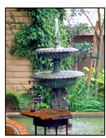
Spanish style tier fountains maximize the sight and sound of water.

Fountain Water transforms a patio into an oasis, a backyard into a stunning garden. It is soothing to hear the fall of water which masks other unattractive noises. As long as you need a fountain for the wedding, why not make it