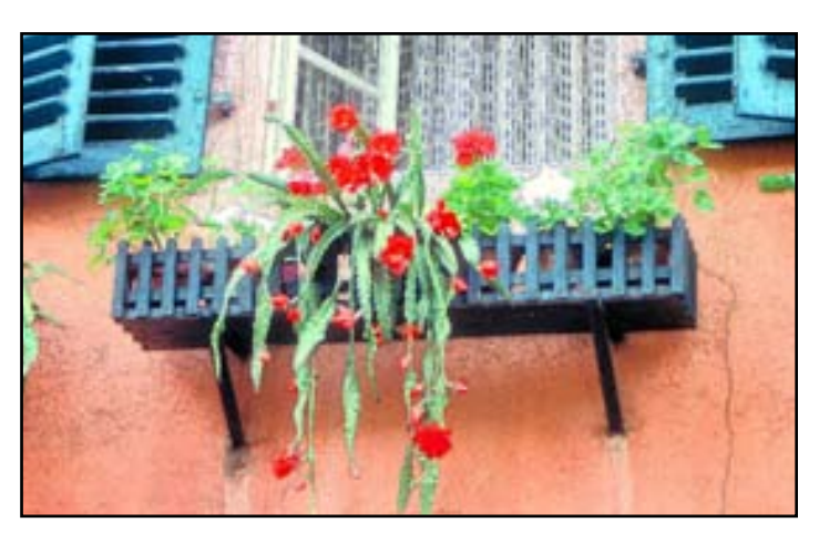
Use uncommon window boxes and plants for a stylized effect.

It's important to choose the containers themselves in a style in keeping with your wedding theme. For example, pedestal urns are ideal for Victorian weddings while terra cotta would be suitable for a Latin or Mediterranean theme. Maintain the same look and feel with all your containers used for the wedding in order to project an integrated appearance. Above all, be sure the containers