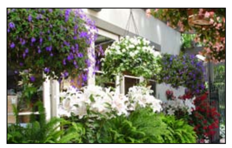
Ferns, potted white lilies and fuchsias enliven a shaded veranda.

Vertical gardening allows you to plant on a whole new plane. Most people see their garden plan in just one dimension: the ground plane. But there is a second dimension that is a wonderful problem solver which allows you to add more plants without sacrificing precious floor space. To really take advantage of vertical gar-