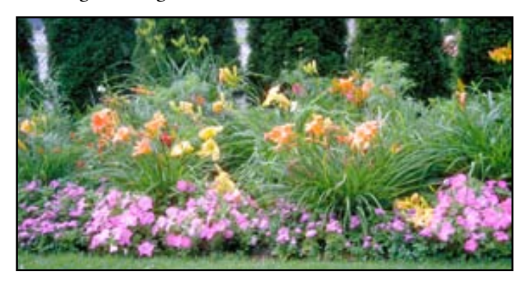
Perimeter planting in three levels - columnar background cypress, a bed of daylilies and petunia edging.

Islands break up expanses of lawns with flowers and sometimes trees and shrubs. Islands increase your flower-gardening area and add interest to an otherwise