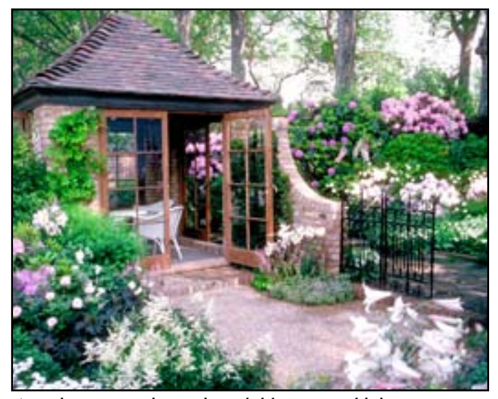
A garden room is designed much like you would decorate any room in the house.

There are also important differences which make outdoor makeovers a bit more complex and intimidating. First, there is the problem of time. You can paint