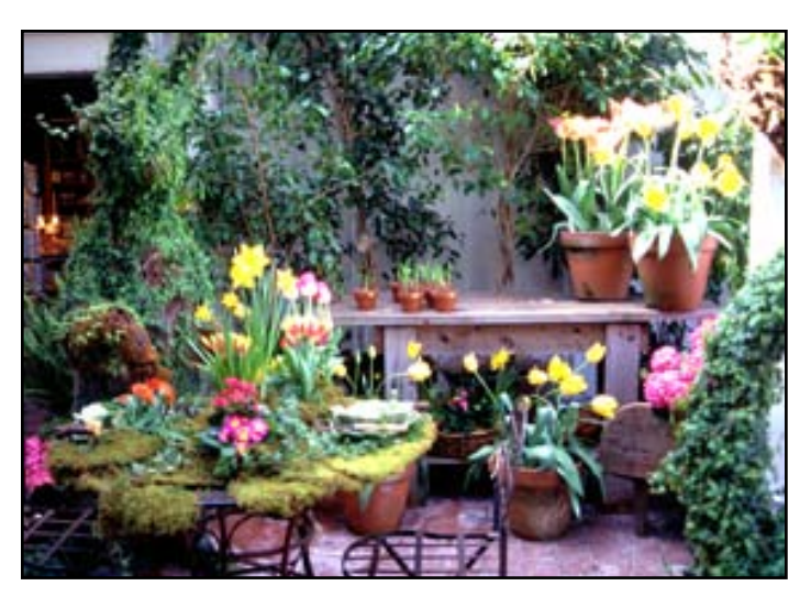
Creative restoration transforms tired outdoor spaces into enchanted garden rooms

Mo Resources for Seeds, Perennials and Bulbs