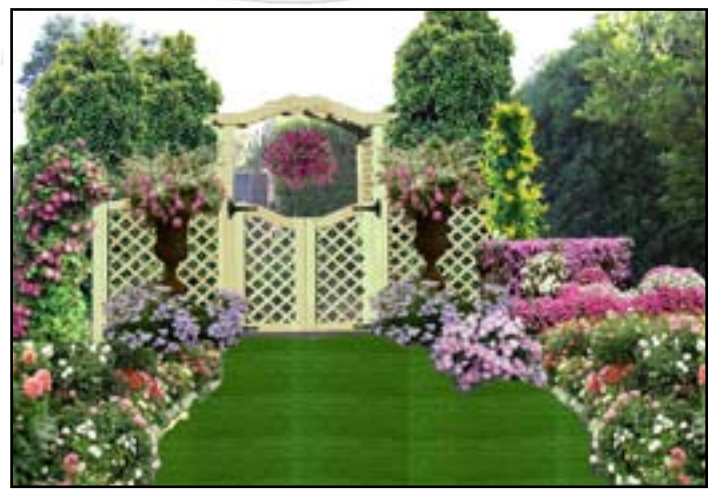
After - Imaging software allows you to see in advance just how an arbor and planting will look fully mature.