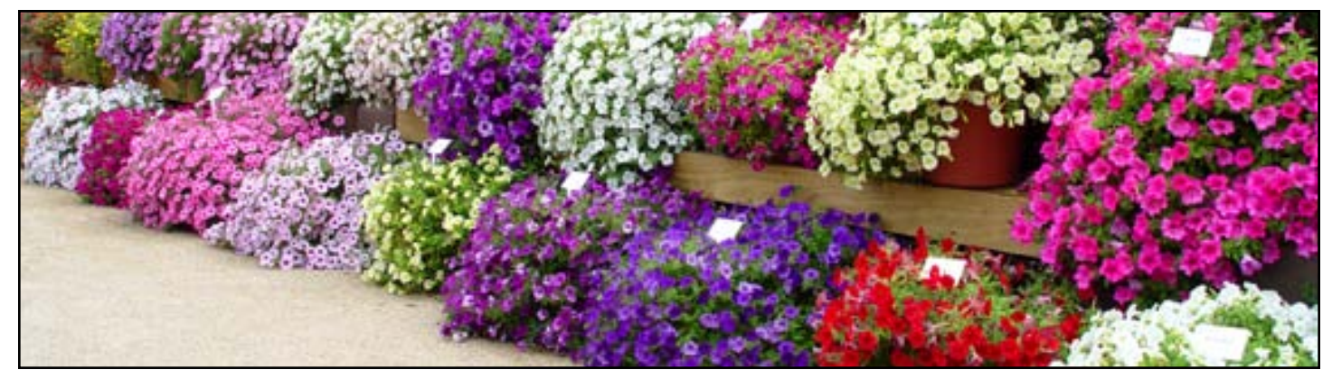
Versatile petunias offer the widest color range in a single plant type.