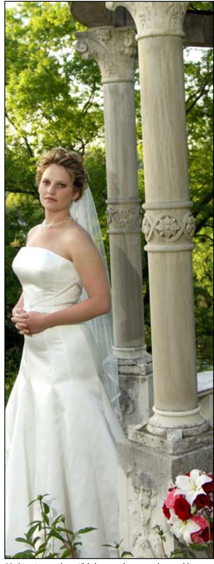
Nothing is more beautiful than an elegant outdoor wedding.

Visit <u>www.MoPlants.com</u> for more MoPlants Garden Guides – coming soon. We welcome your input on the subjects you would like Mo to cover in upcoming e-books. Please e-mail your comments to debbie.moplants@yahoo.com