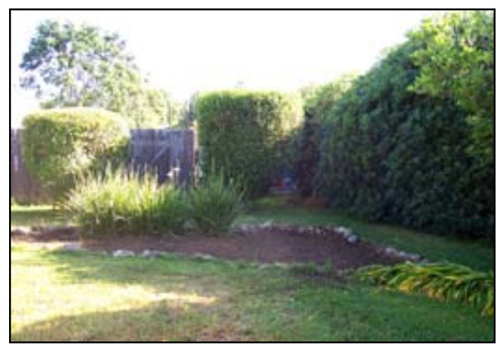
Before - Actual photo of yard.

screen, and it will speed the design process considerably. This example was created using Mo's Garden Maker imaging software available at www.moplants.com