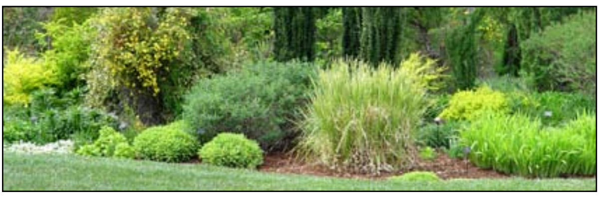
A focal point looks best against a background of dense greenery.