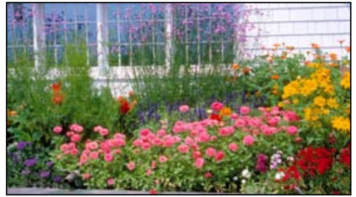
Fast growing plants and flowers can cover up a multitude of building problems.

Perimeters should always be well planted to soften the visual limits of a garden. No one wants to look at the bottom of a fence, particularly if it has been discolored