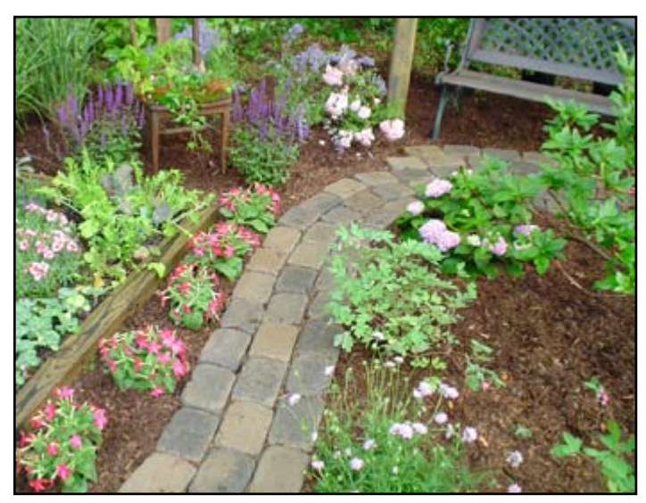
Inexpensive tumbled concrete pavers are a good alternative to expensive hewn stone.

Installing units right on soil is the cheapest way to install them, but it can result in an uneven surface if not perfectly level and drained. A setting bed of compacted sand or sand mixed with dry mortar is the best way to do it because you can level the sand and set each paver in place. The sand allows water to drain away from the pavers so they don't "squish" if the area is over-watered or doesn't drain well.