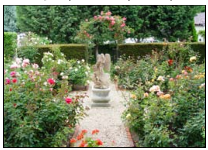
Pea gravel with brick edging is classic and timeless.

Loose materials make the best choice for dealing with expansive areas due to low cost. In Europe, pea gravel and decomposed granite have long been the gold stan-