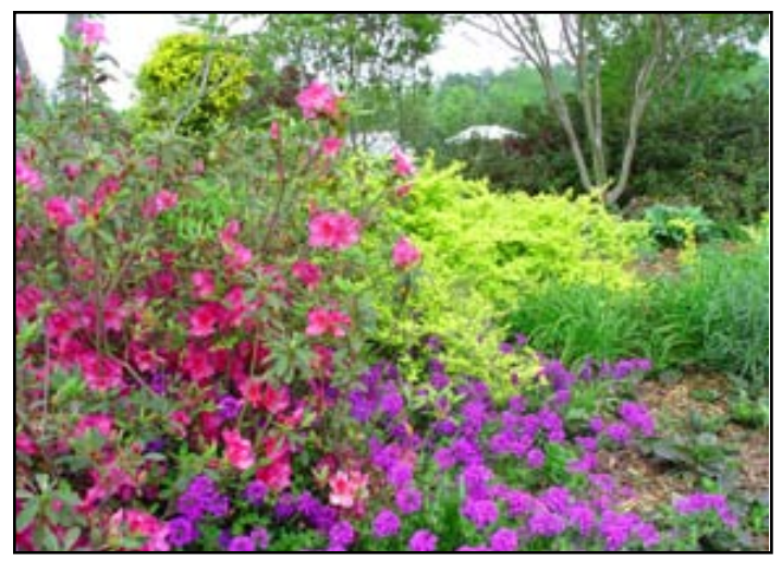
Adding high contrast accents to shrub beds adds a more vibrant dynamic.

When there are too many trees in your yard, overcrowding can result in the same conditions as well as illhealth for the trees. Dripping sticky matter from leaves is a common symptom of pests often caused by overly dense groves and canopies. Removing a tree can open space and enhance the overall health of those that remain.