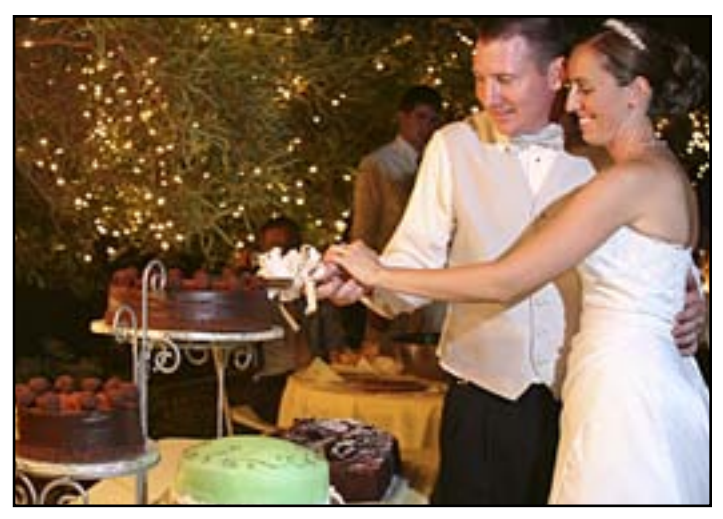
A splash of twinkling white lights turns a nighttime wedding reception into a magical event.

Garden Fountains <u>www.garden-fountains.com</u> Outstanding classical designs, big selection of wall fountains.