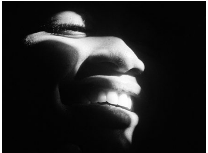
Tolo Pule