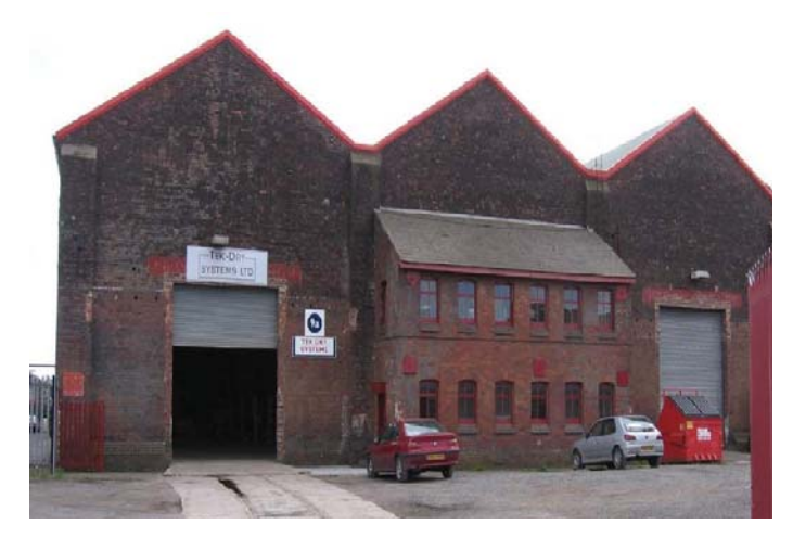
Figs 7 and 8: Boiler shop and riveting tower above; north gable of the millwrights shop below