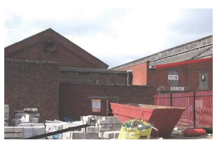
The tube shop from the south

Built by the company in 1887, to provide lunchtime space for over 1000 men from outside Horwich. It is important as an example of a surviving welfare building provided for the workers. Historically, it adjoined the L & Y Arms café fronting Chorley New Road, now demolished, and there was a convenient pedestrian entrance into the works at the foot of Gooch Street. Architecturally similar to the workshops, the dining room has plain brick elevations with windows recessed in panels, and a single span slate roof. The building is now in use for the manufacture of glass objects, and has PVCu windows with an extension on the Chorley New Road gable-end; the gable rebuilt in brick late 20th century (Fig.14).