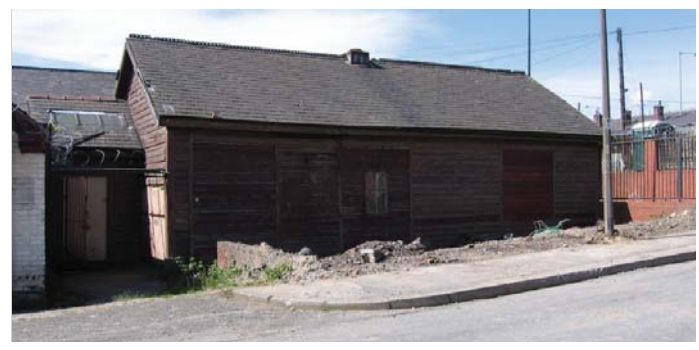
Figs 19 and 20: Timber sheds, adjacent to the small workshops above, on Brunel Street below