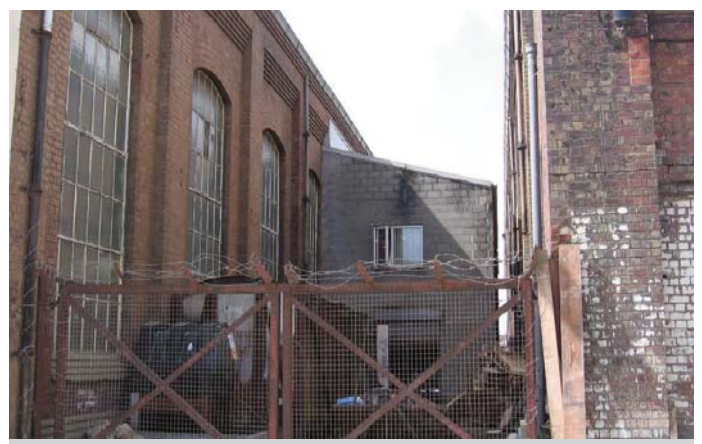
Figs 26 and 27: Lean-to addition to west side of erecting shop, and infill adjacent to heavy machine shop