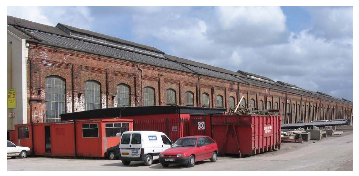
Fig 1: View of the southern section of the former erecting shop from the north-west; the pale cladding to the left gable marks the demolition of a central section

The works were closed by British Rail Engineering Ltd. in 1983, although the foundry operated until 2004. The site has since been fragmented into different ownerships, and most of the surviving workshops are now occupied by new uses, mainly industrial (B2). The continuation of heavy industrial uses has maintained the robust character of the works, although the fabric of the buildings is now under threat through lack of regular maintenance and repair. Some buildings have been demolished or remain empty, for example the former stores, whilst others are under threat of demolition – including the former hospital. Alterations to the buildings to accommodate new uses have not been significant except in a few cases; the buildings' robust character can accommodate most minor changes such as new gable-end doorways, without harming the character of the whole site. Additions, such as the lean-to on the west side of the erecting shop, and infill between some sheds has had a visual impact on views. The character of the works is being gradually being affected by the accumulative impact of poor maintenance and uncoordinated alterations, and by the deterioration of the setting. Radical change will be needed to ensure that the Conservation Area has a long-term future.