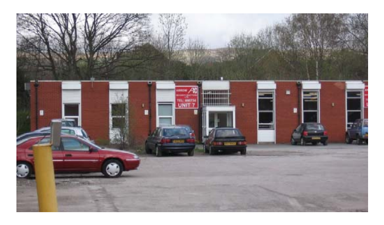
Fig 23: Office east of the stores

The single-storey flat-roofed brick office building was built after rail privatisation. Set back from the historic works, to the east of Rivington House, the building's design contrasts with the works. In view of its low scale, it has a neutral impact on the character of the Conservation Area (Fig.23).