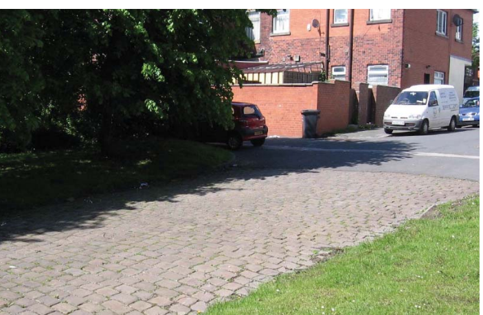
Figs 32 and 33: fencing across the former workers' entrance on Gooch Street, and stone setts at the bottom of Brindley Street, just outside the conservation area