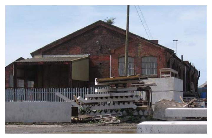
Figs 17 and 18: North elevation of paint shop and south gable of spring smithy