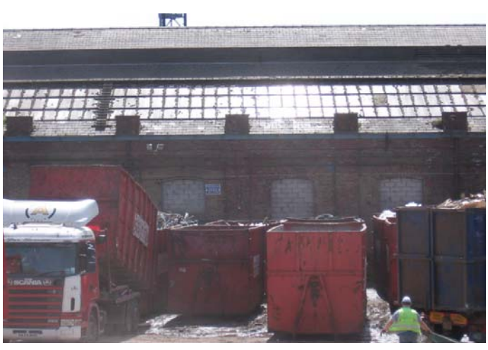
Figs 9 and 10: Fitting shop sliding door to left, spring shop chimneys visible in Fig 10