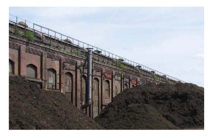
Part of the forge from the west

The largest building at the works, completed in 1886 and over 450 metres long, but now divided into two. The buildings are significant as the workshops where locomotives were built and repaired; there was space for 100 locomotives, including the 2-4-2 tank engines and Atlantic class locomotives, both designed by Aspinall. Armoured vehicles were built here during World War II. The workshop has two main slated roof ridges, either side of a lower central top-lit ridge (Fig.12). The shop has been divided into two by the demolition of around 6 central bays, the new gables clad in metal sheeting. Other alterations include enlarged gable-end door openings and a lean-to extension clad in pale grey metal sheeting on the south west elevation. This long elevation is particularly important in views from the west (Fig.1). The brickwork exhibits signs of water damage from defective rain water goods.