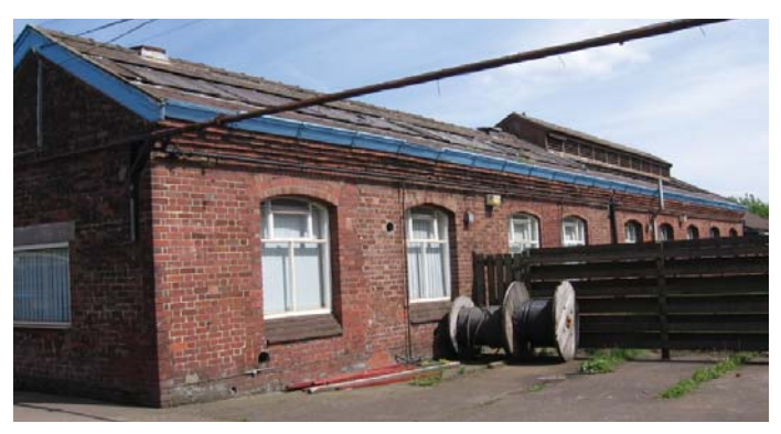
Figs 21 and 22: The entrance to Armstrong Environmental and a small ancillary building, now offices