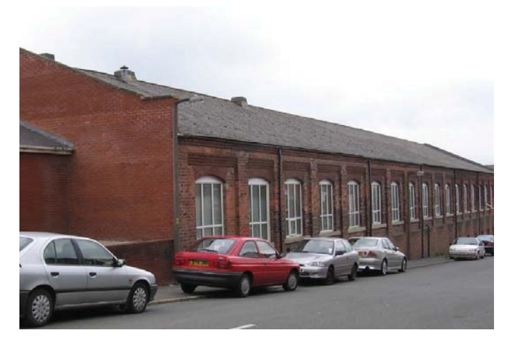
Figs 13 and 14: The tube shop from the south and the dining room on Gooch Street