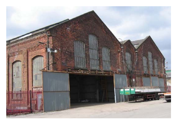
Figs 11 and 12: Part of the forge from the west left and the south west gable of erecting shop above