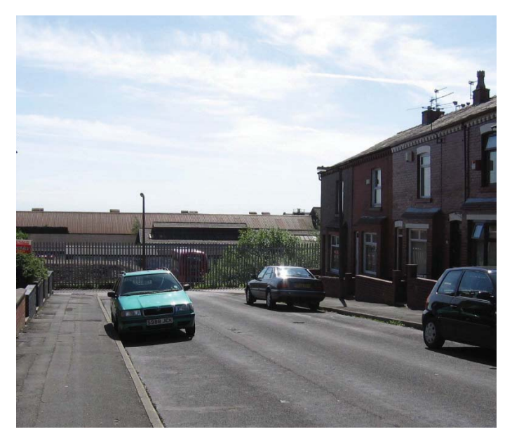
Figs 34 and 35: The Victoria Pub, Chorley New Road and Telford Street with the foundry beyond