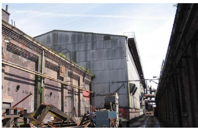
Figs 24 and 25: Mechanised foundry cupola on above, portal frame shed below