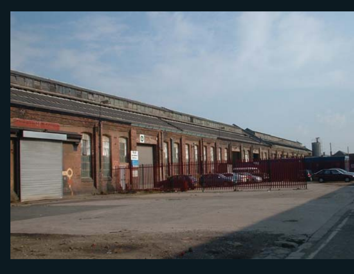
Conservation Area Management Plan