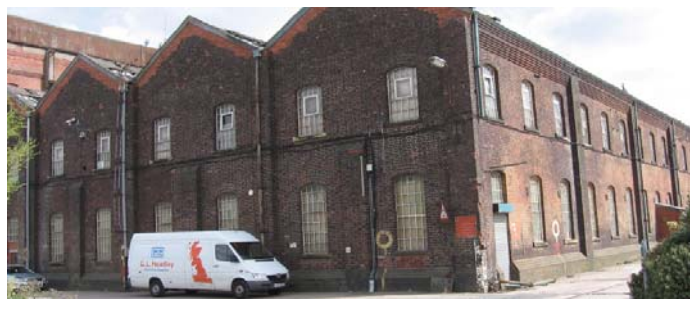
Figs. 3 and 4: Rivington House to the left, former stores to right.