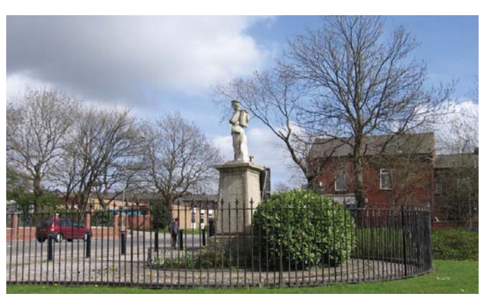
Figs 15 and 16: Cottage Hospital on Brunel Street, and War Memorial facing Chorley New Road