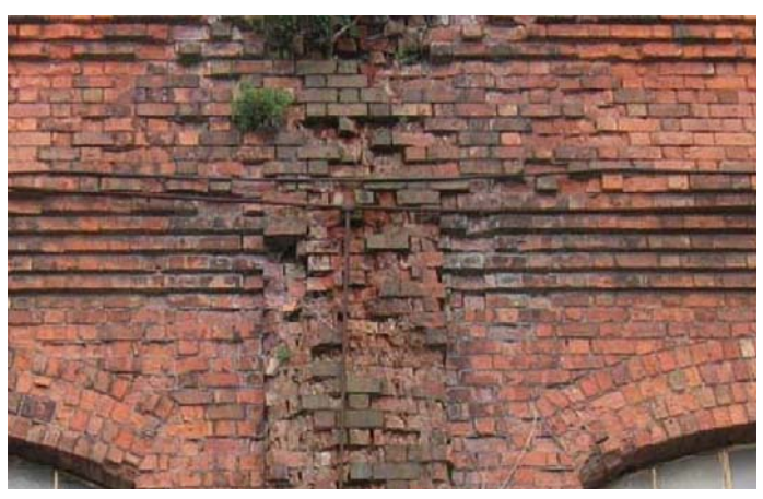
Figs 28 and 29: The site of the demolished boiler works and a typical example of neglected gutters causing severe brickwork damage