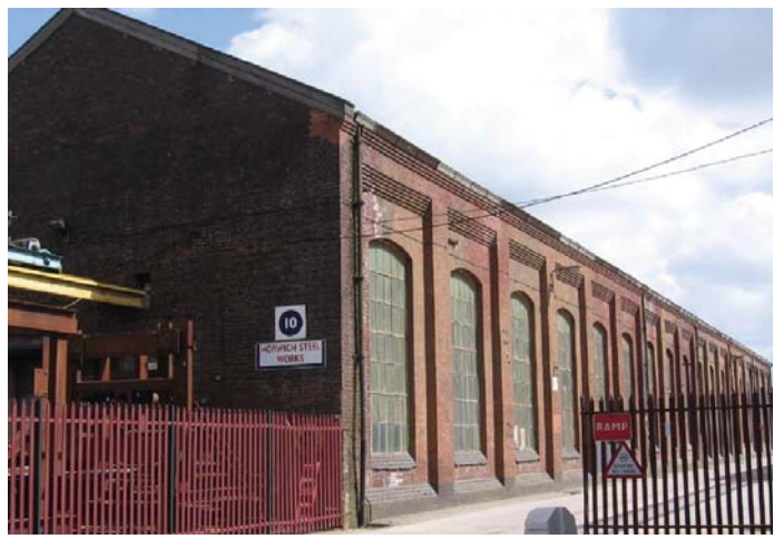
Figs 5 and 6: small workshops, and heavy machine shop to right.