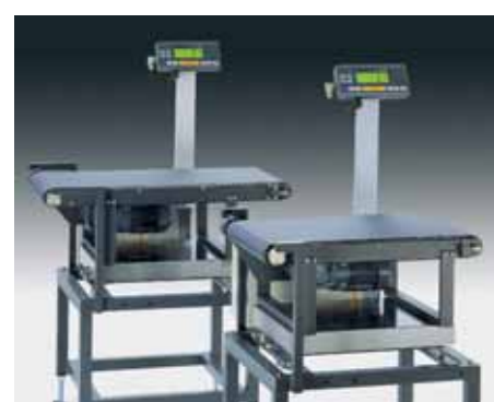
Weighing module WM35