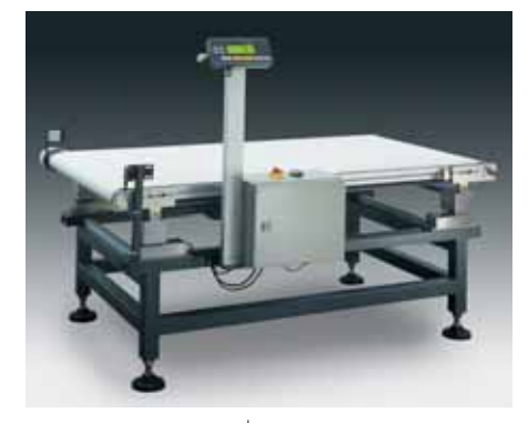
Weighing module WM60|WM120