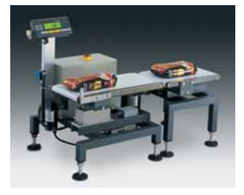
Weighing module WM6