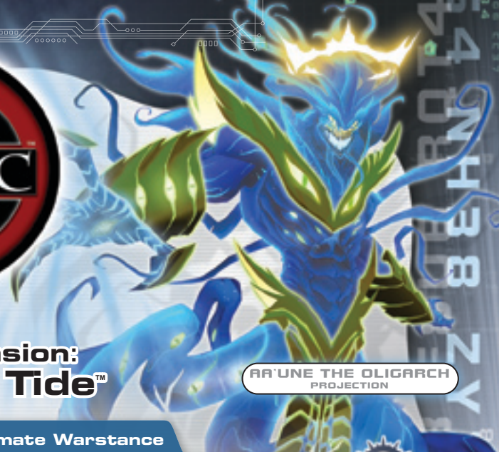
AA'UNE THE OLIGARCH PROJECTION