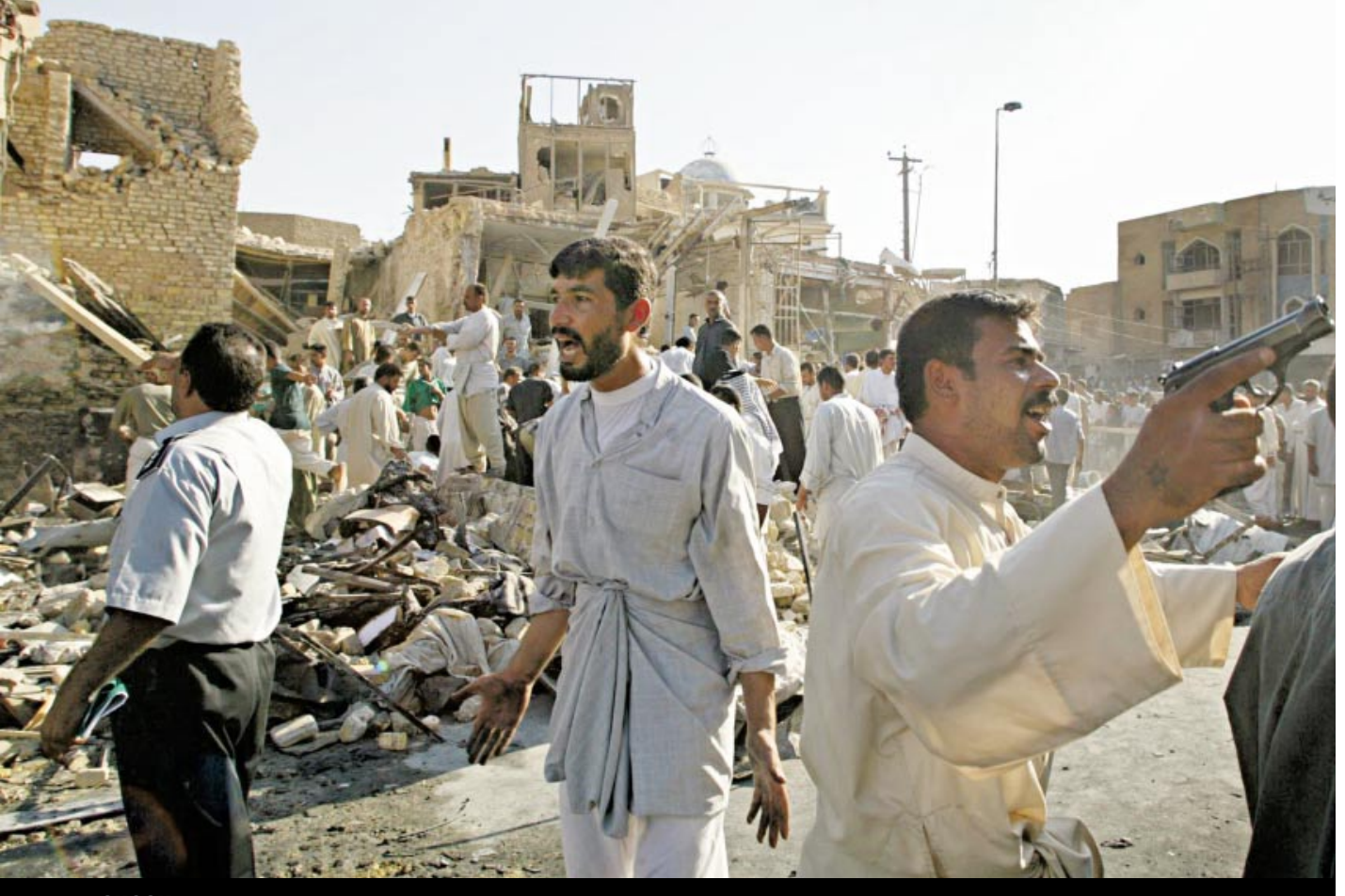
SHOCK. Iragis try to hold back family members of the dead and injured as others dig through the rubble left by the car bomb.

the danger is very near to us, and we are afraid that one day our movement will be assassinated and our freedom too. Our enemies are planning to assassinate our movement."