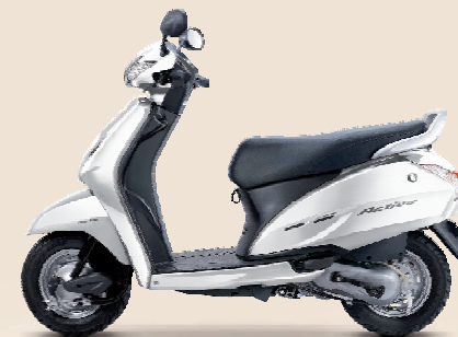
PEARL SUNBEAM WHITE

*The technical specifications and design of the vehicle may vary according to the requirements and conditions, without any notice. Activa meets Bharat Stage III norms. *Based on internal Honda test, however not effective in damage or L-shaped cut in the tyre. Whenever you find a foreign object nailed on the tyre, please remove it immediately and get the tube repaired at the nearest puncture shop. Accessories shown in the picture is not a part of the standard equipment. *Based on Internal Honda driving mode considering various simulated actual driving conditions. **Conditions apply.