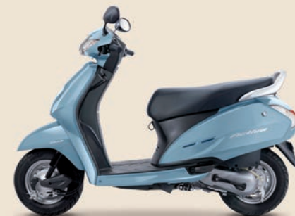
ORCHID BLUE METALLIC