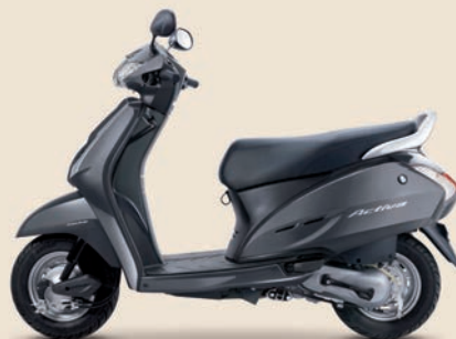
GENY GREY METALLIC