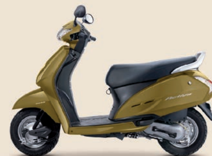
ARMOUR GOLD METALLIC