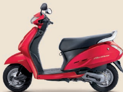
CANDY LUCID RED