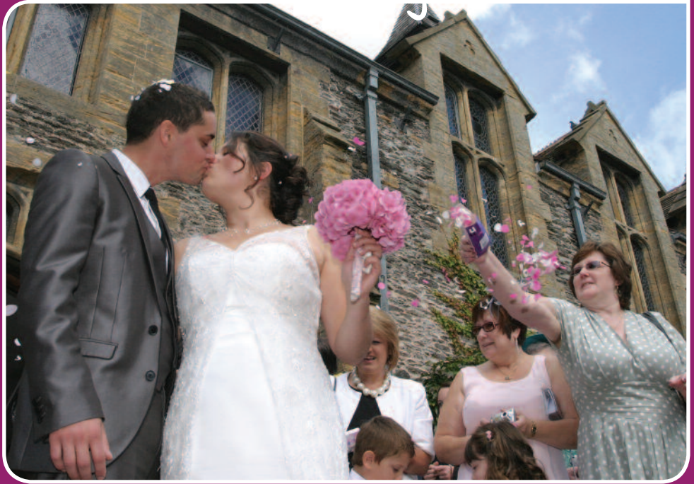
Municipal Buildings, Corporation Street