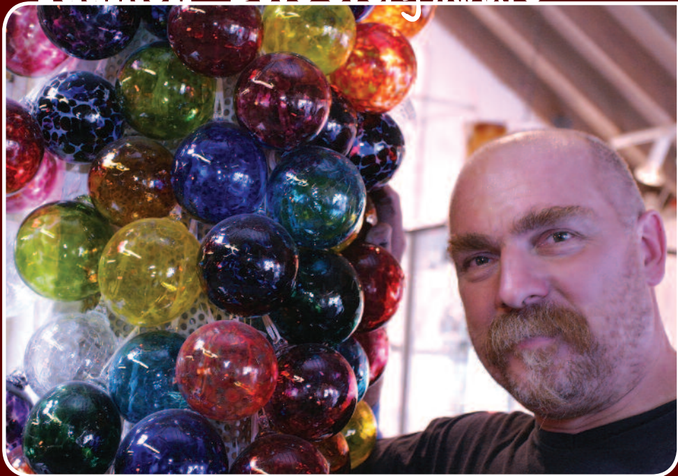
Will Shakspeare, Shakspeare Glass