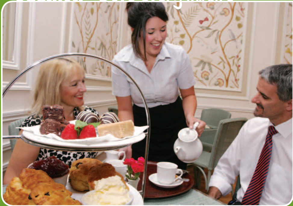
Mr. Miles Tearooms on the High Street