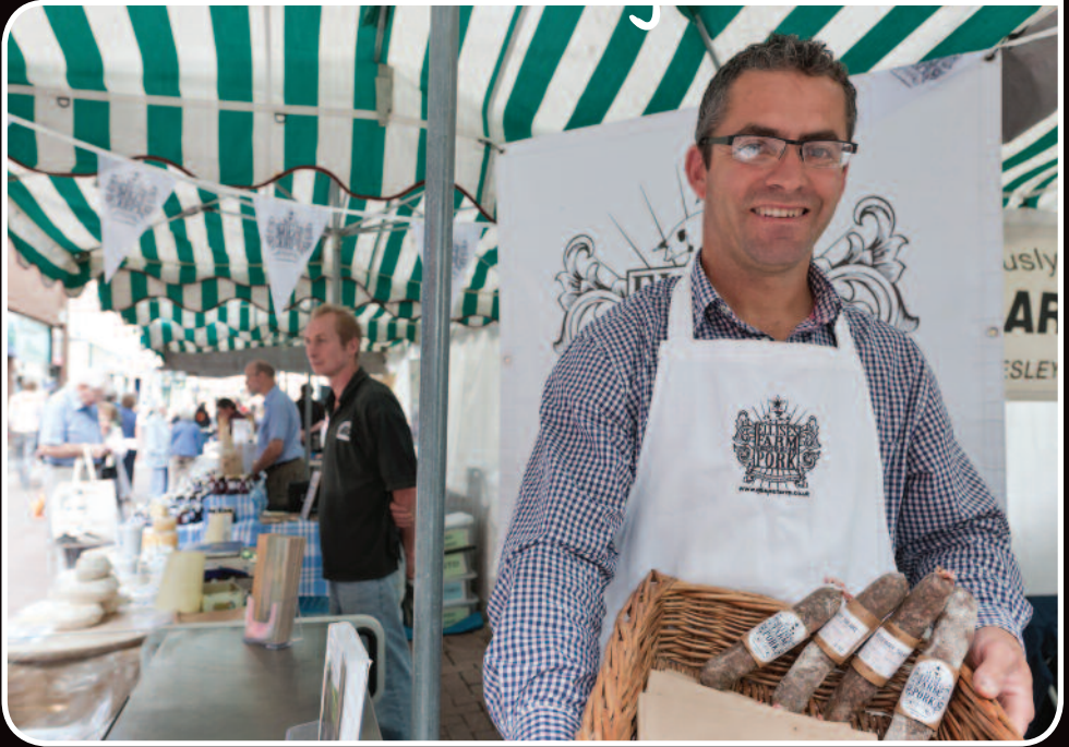
Vale of Taunton Farmers' Market