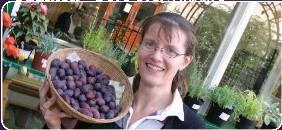
Taunton Country Markets, Bath Place