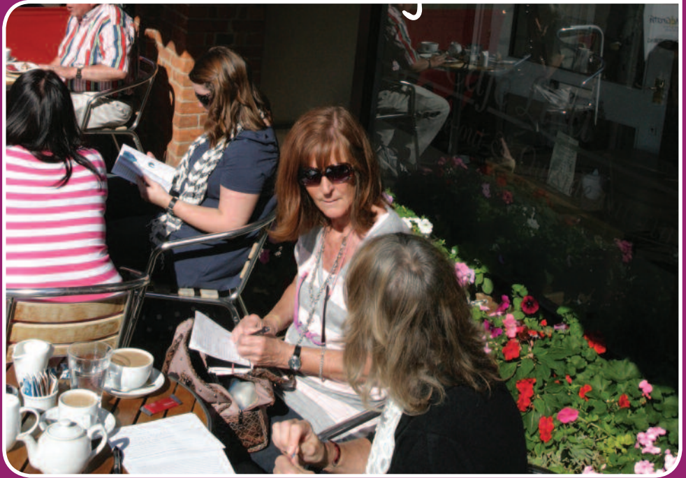
Café Lisa on Paul Street