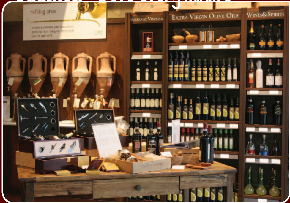
Olio & Farina, Somerset Square