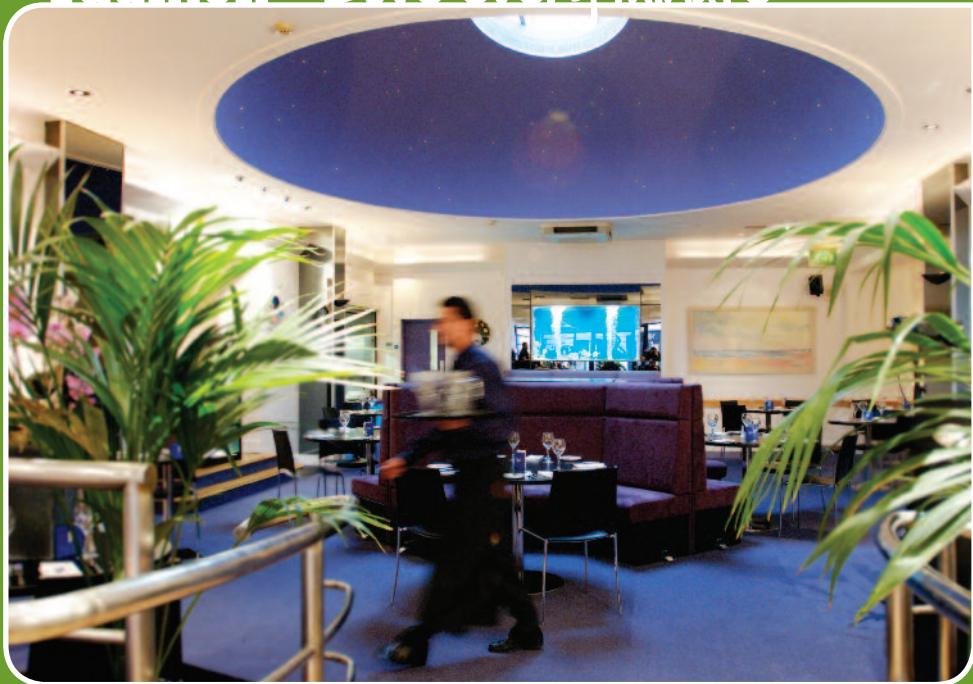
Brazz on Castle Bow