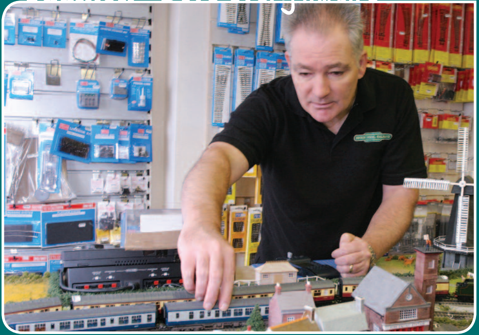
Mikron Model Railways, Station Road