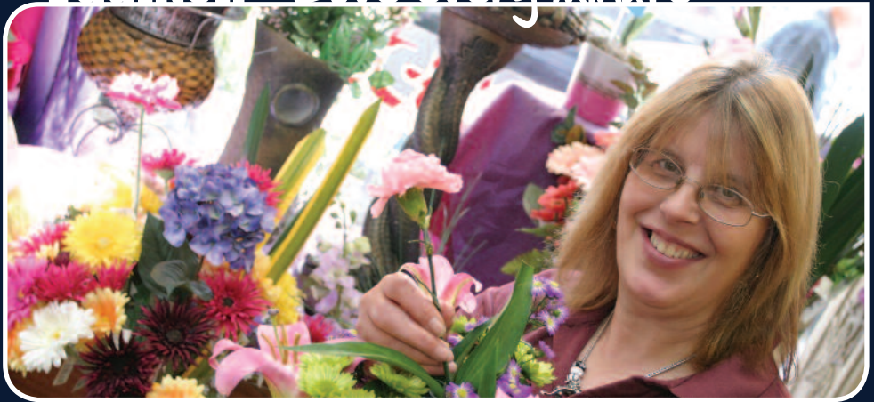
County Flowers of East Reach