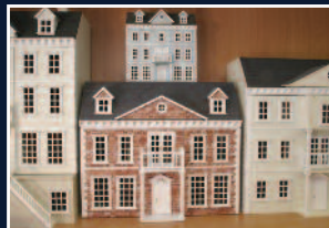
Phil's Dolls House Shop