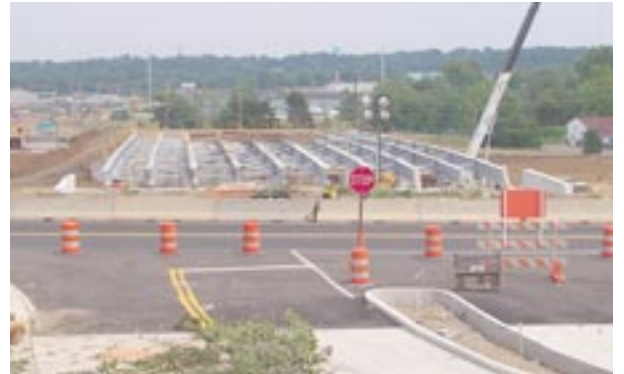
Looking east from The Strip