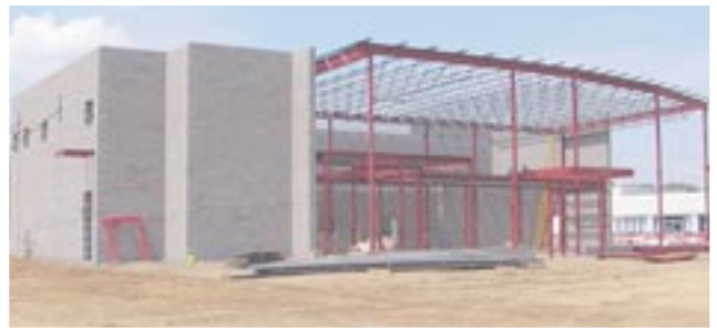
Cain BMW under construction

The growth in North Canton and Jackson Township in Northern Stark County continues. With growth comes a plethora of transportation problems and solutions as well as the expansion of retail stores.