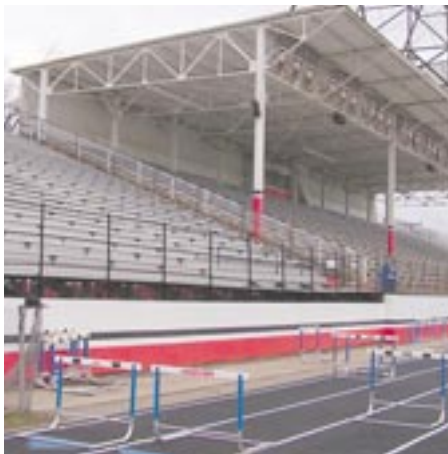
Home side of North Canton Memorial Stadium