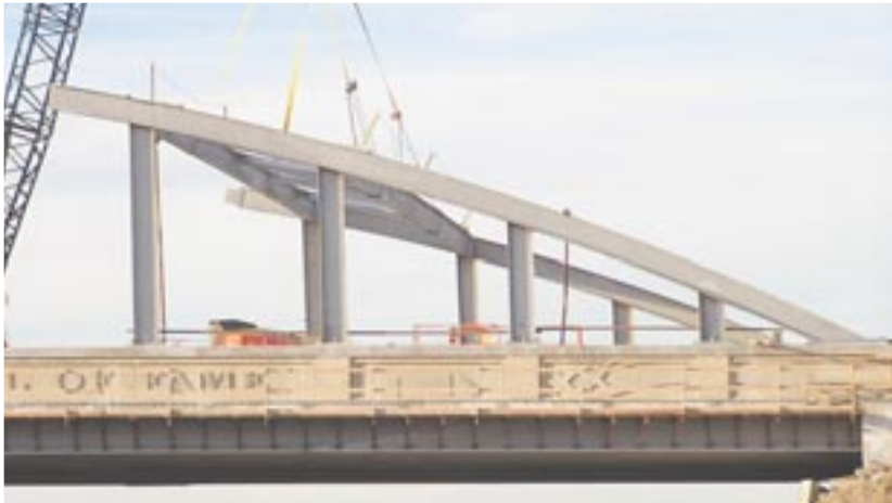
Installation of arches