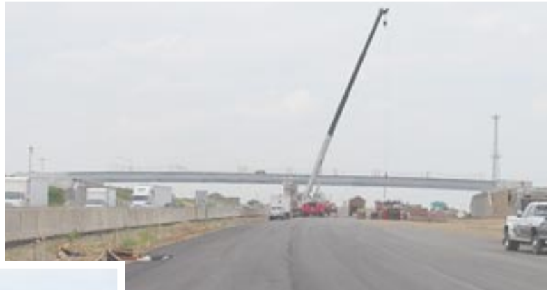
Looking north on I-77