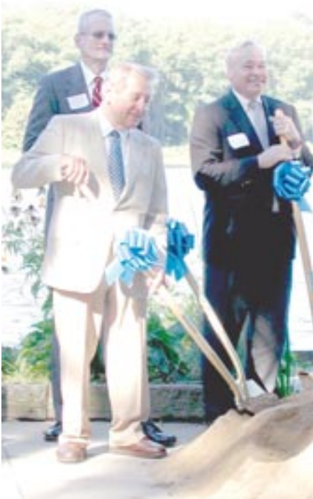
Congressman Ralph Regula

Recent groundbreakings signaled the start of two highly anticipated buildings. The Stark County Park District and the Stark County District Library have teamed up to construct a new building that will house the SCDL Perry Branch