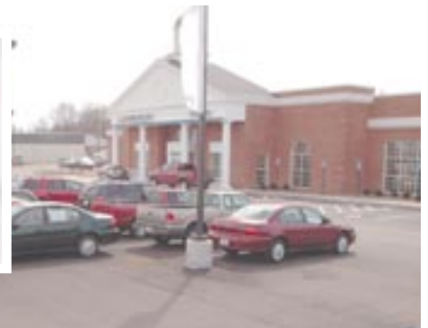
Spitzer Chevy in Jackson Township