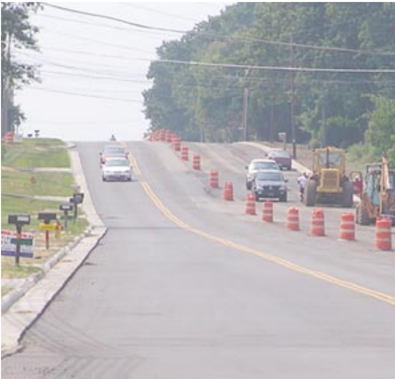
Jackson Township's Portage Street widening ready for traffic.