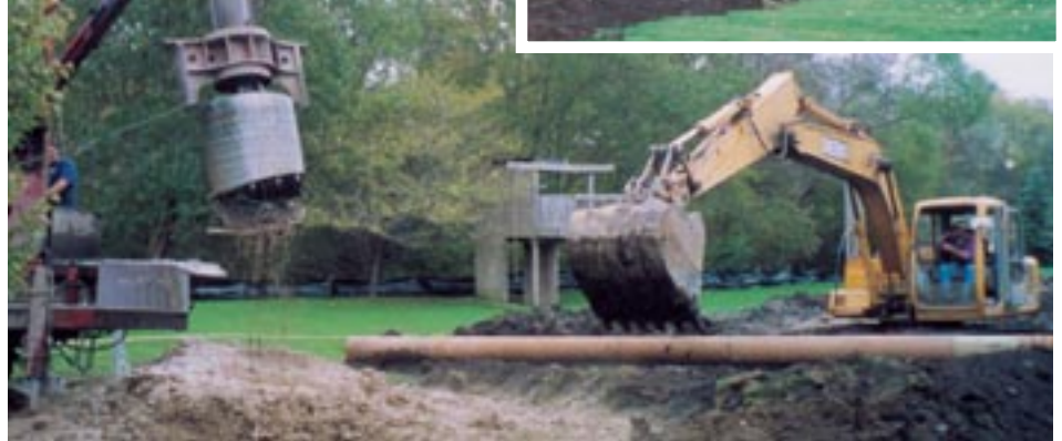
Dewatering well installation