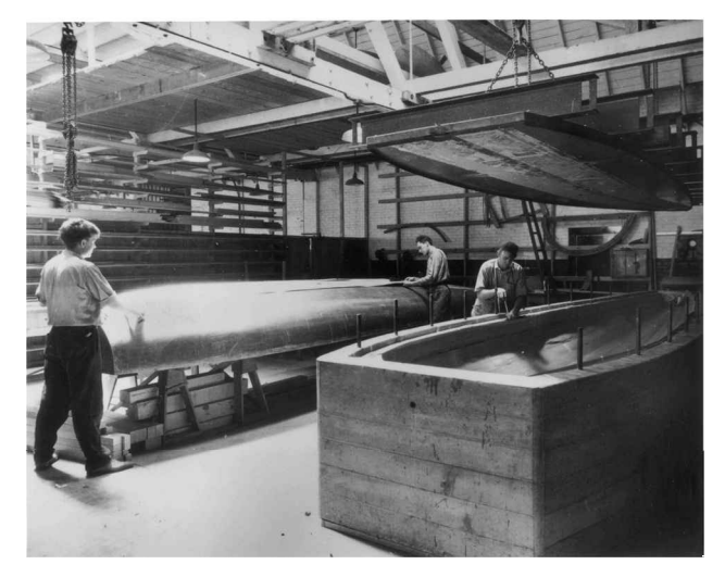
Fig. 7 Forming Lockheed monocoque fuselage shells in concrete molds (SI negative number 91-3446).

reduced drag and cut down on weight, the ever-present goal of all aircraft designers.<sup>9</sup>