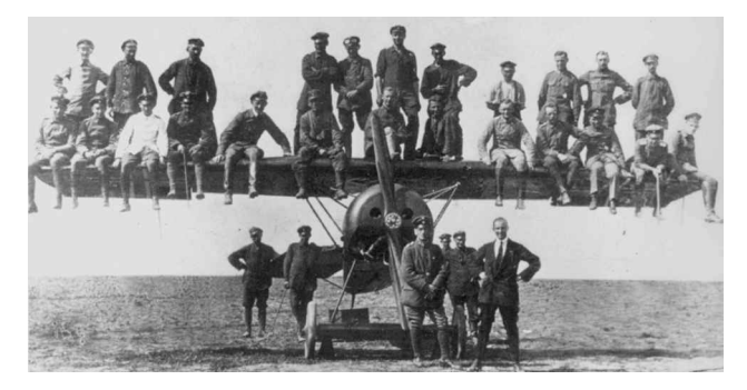
Fig. 5 Sleek 1918 Fokker D.VIII monoplane foreshadowed a coming standard with its thick-sectioned, plywood-sheeted, cantilevered single wing; Anthony Fokker, in front in necktie, humorously demonstrates the strength of the D.VIII wing design (SI negative number A2185).

the fuselage out of a thin wooden shell, supported internally by bulkheads and longitudinal stringers. The result was an incredibly strong, streamlined, tubelike structure.