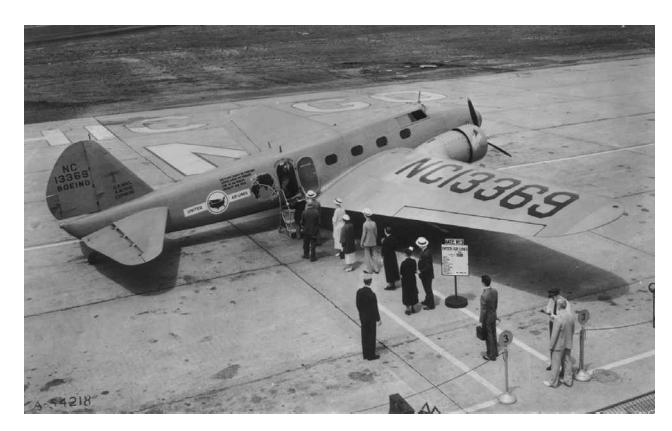
Fig. 8 Boeing 247D, introduced in 1933 (SI negative number A42344-E).

If we are looking expressly at the structural design of the airframes, the 247 and the DC-3, in fact, exhibit a number of features strikingly reminiscent of those developed years earlier. Take the wing, for example. On the Boeing 247, the design was essentially the same as the cantilevered monoplane wing developed by Fokker during World War I, except that it was constructed of metal. The 247 had a thick-sectioned monoplane wing with a heavy main spar as the primary load-bearing member. (A common memory of anyone