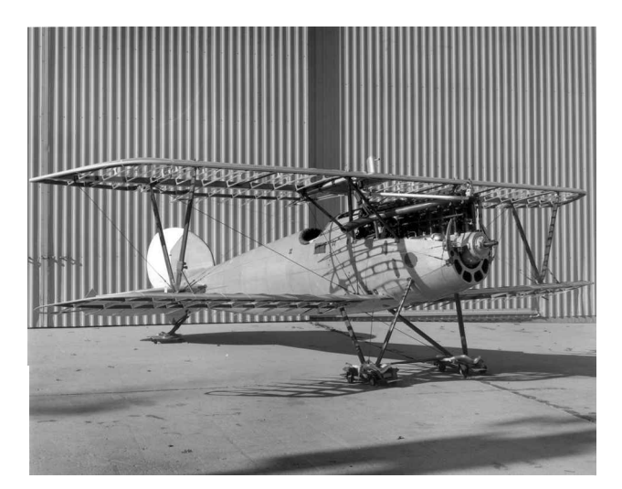
Fig. 6 Albatros fighter with fabric covering removed, showing its plywood monocoque fuselage (SI negative number 78-18979).

The real breakthrough in monocoque construction came in 1918 with a process developed by the Loughead Aircraft Manufacturing Company. (The Loughead brothers were forced to suspend operations in 1921, but with new financing formed another firm in 1926 called the Lockheed Aircraft Company with the more familiar spelling of their name.) Working with their engineer, a young Jack Northrop, and factory superintendent Tony Stadlman, Allan and Malcolm Loughead patented a method of forming fuselage halfshells out of spruce veneer in large concrete molds fitted with a rubber bladder (Fig. 7). The veneers were set in place, casein glue was applied, and the bladder was inflated to force the wood into the mold. After the glue cured, the shells were removed from the mold, and two beautifully formed fuselage halves were then joined over a light skeletal framework. The advantage of the monocoque fuselage was that, because of the comparatively lesser amount of internal structure needed due to the intrinsic strength of the molded shell, the same interior height and breadth could be achieved with a significantly smaller overall cross-sectional area. This of course