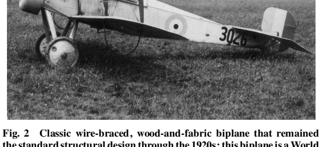
Fig. 2 Classic wire-braced, wood-and-fabric biplane that remained the standard structural design through the 1920s; this biplane is a World War I Bristol Scout (SI negative number 78-18721).

The other key design innovation of the period was the monocoque fuselage. French for single shell, the monocoque fuselage did away with the familiar fabric-covered box-girder approach by making