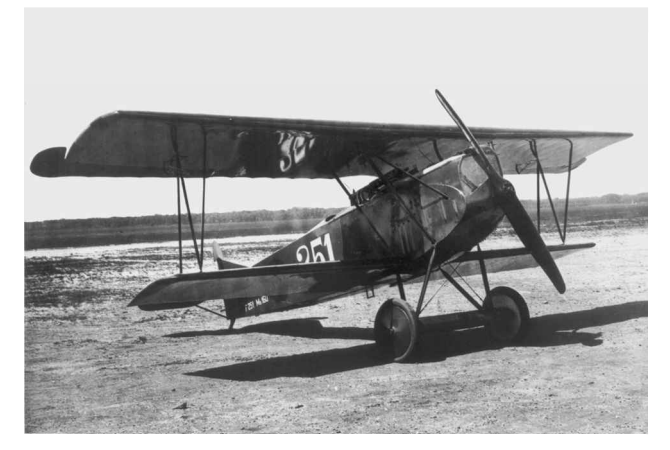
Fig. 4 Fokker D.VII had structural features similar to the Dr. I (SI negative number 94-7729).