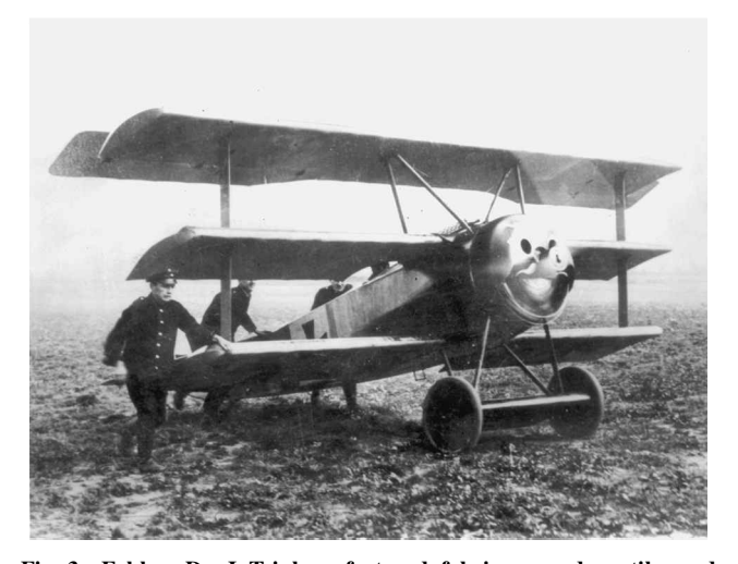
Fig. 3 Fokker Dr. I Triplane featured fabric-covered cantilevered wings with box spars; note the absence of wire bracing between the wings (SI negative number A9851-A).