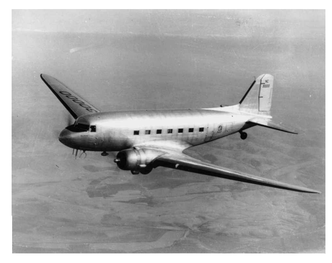
Fig. 9 Revolutionary all-metal Douglas DC-3 passenger airliner, introduced in 1935 (SI negative number A45861).