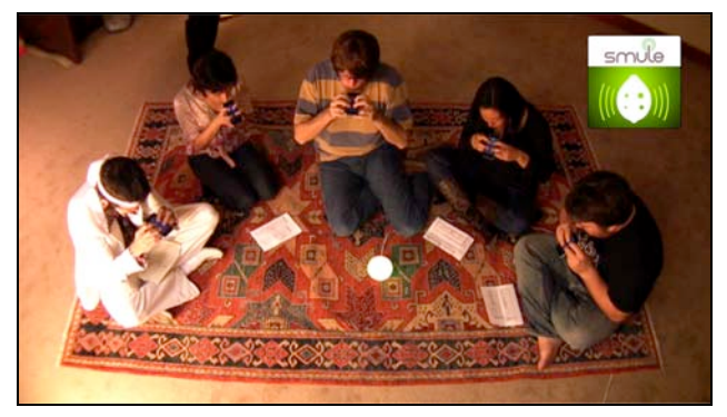
Figure 1. An ensemble of iPhone Ocarina players, rendering the introduction to Led Zeppelin's Stairway to Heaven.

However, the described interface is only half of the instrument. Ocarina is also a unique social artifact, allowing its user to hear other Ocarina players throughout the world while seeing their location – achieved through GPS and the persistent data connection on the iPhone. The instrument captures salient gestural information that can be compactly transmitted, stored, and precisely rendered into sound in the instrument's World Listener , presenting a different way to play and share music. In the first six months since its release in November 2008, Ocarina has been downloaded and played on more a million devices, while its users have collectively listened to more than 20 million performances.