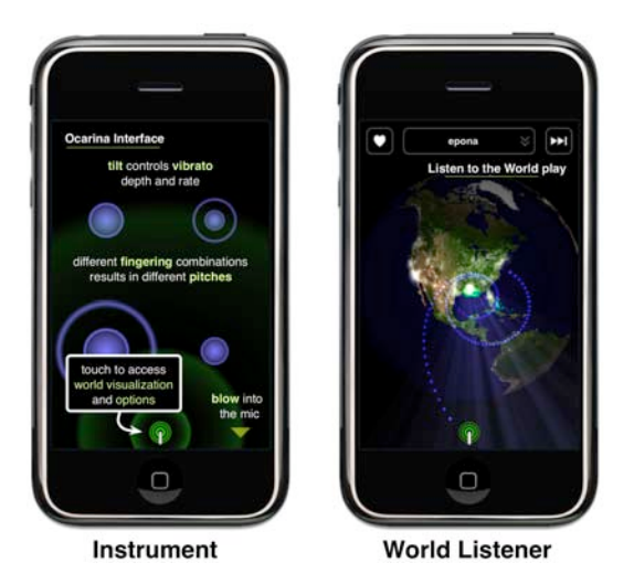
Figure 4. Screenshots of the instrument and the World Listener.

fingering. For example, the Smule Ocarina allows the player to choose the root key and mode (e.g., Ionian, Dorian, Phrygian, etc.), the latter offering alternate mappings to the fingering.