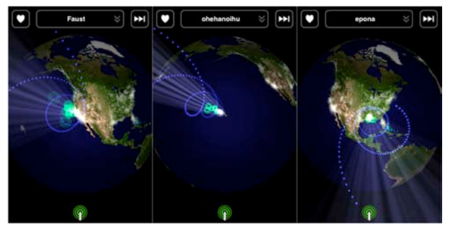
Figure 5. Screenshots of in the World Listener , rendering snippets from actual users. Ocarina now has more than one million users worldwide.

The anonymity of the social interaction is also worthy of note – everyone is only identified via a self-chosen handle (e.g., Link42), their GPS location, and through his/her music. And yet, according to overwhelming user feedback, this seems to be compelling in and of itself.