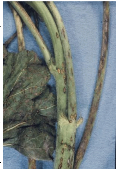
Figure 2. Hollyhock rust pustules on hollyhock stem.