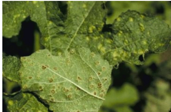
Figure 1. Hollyhock rust pustules (sori) on the upper and lower sides of hollyhock leaf.

Rust first appears primarily on the undersides of the lower leaves as lemon yellow to orange, almost waxy pustules (or sori) that turn reddish brown to chocolate brown with age. Larger, bright yellow to orange spots with reddish centers develop on the leaf surface opposite the pustules. The rust quickly spreads to other leaves, which become covered with small, reddish brown to chocolate brown pustules. These pustules, filled with thousands of microscopic dark brown spores (teliospores), appear primarily on the underleaf surfaces, but they may appear to a lesser extent on the upper side of the leaves or on the petioles, stems, and flower bracts (Figures 1 and 2).