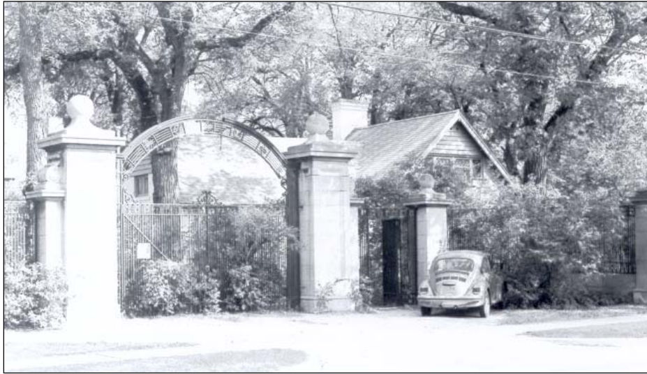
Plate 10 – The gatehouse and gates, 1980. The gable end on the right is the original structure; the addition is to the left. ( City of Winnipeg Planning Department. )