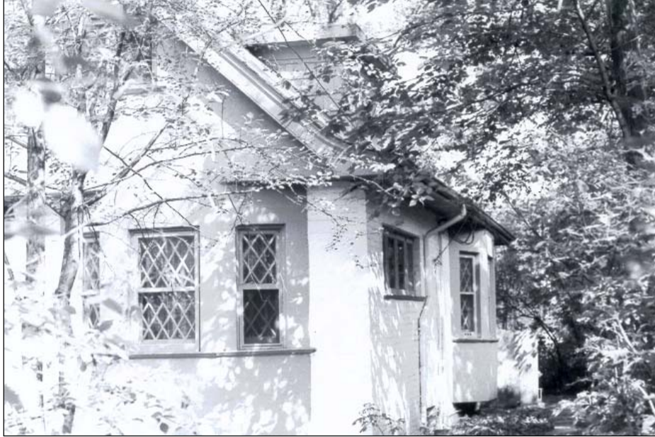
Plate 12 – A view of the south-east corner of the gatehouse, 1980.