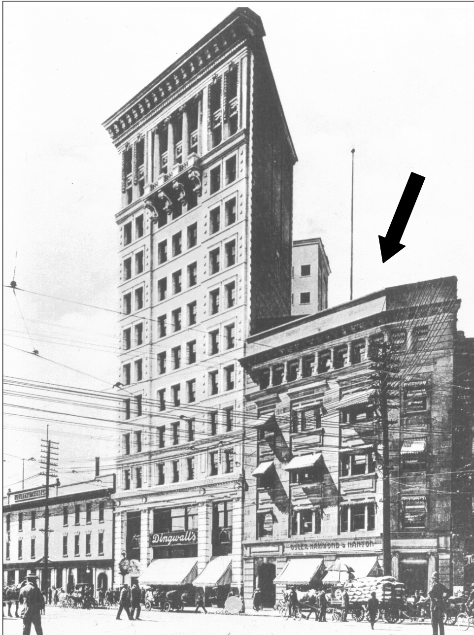
Plate 7 – An early view of the Nanton Building on the northwest corner of Portage and Main (arrow), ca.1910. It was designed by Darling and Pearson and erected in 1908.