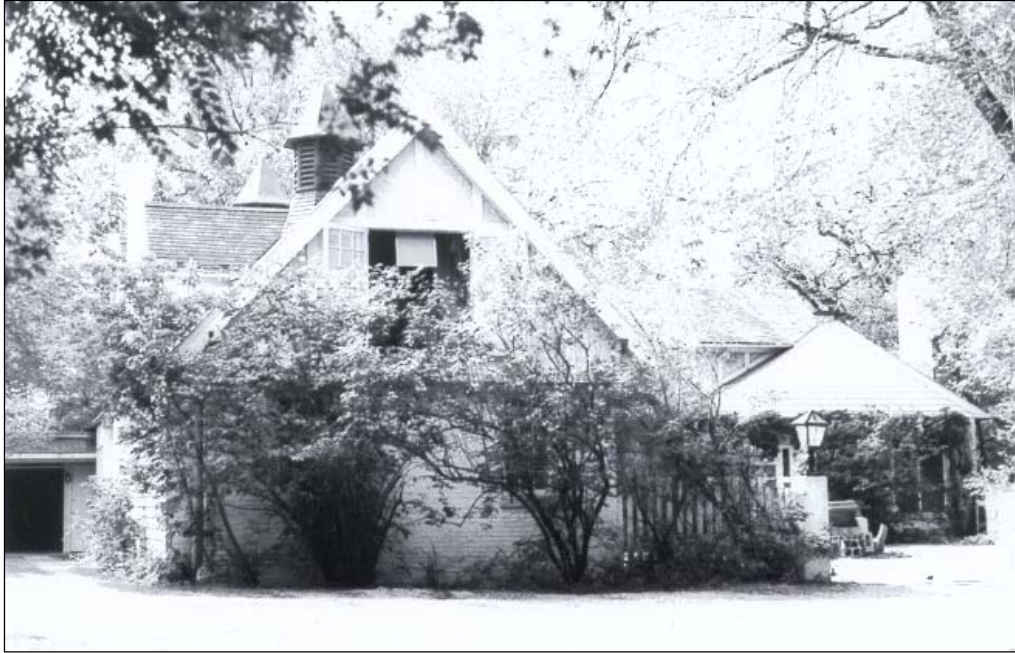
Plate 14 – The former stables, now converted to a house, 1980.