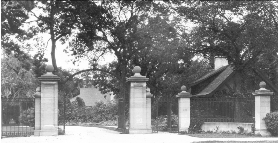
Plate 5 – The main gates, gatehouse on the right and roof of the stables in the centre background, 1924. The driveway curved to the west (left) and up to the main house. The original design of the gatehouse façade can be seen here. The bell-cast upturn to the gables roof seems to be a fanciful flair that is not repeated in the other buildings. The additions to the gatehouse erected a cross-gable effect.