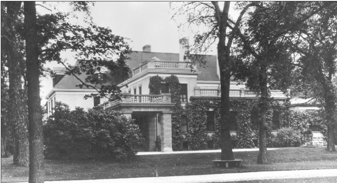
Plate 2 – A side view of Kilmorie, 1924. The exterior was a light brick on a limestone foundation.