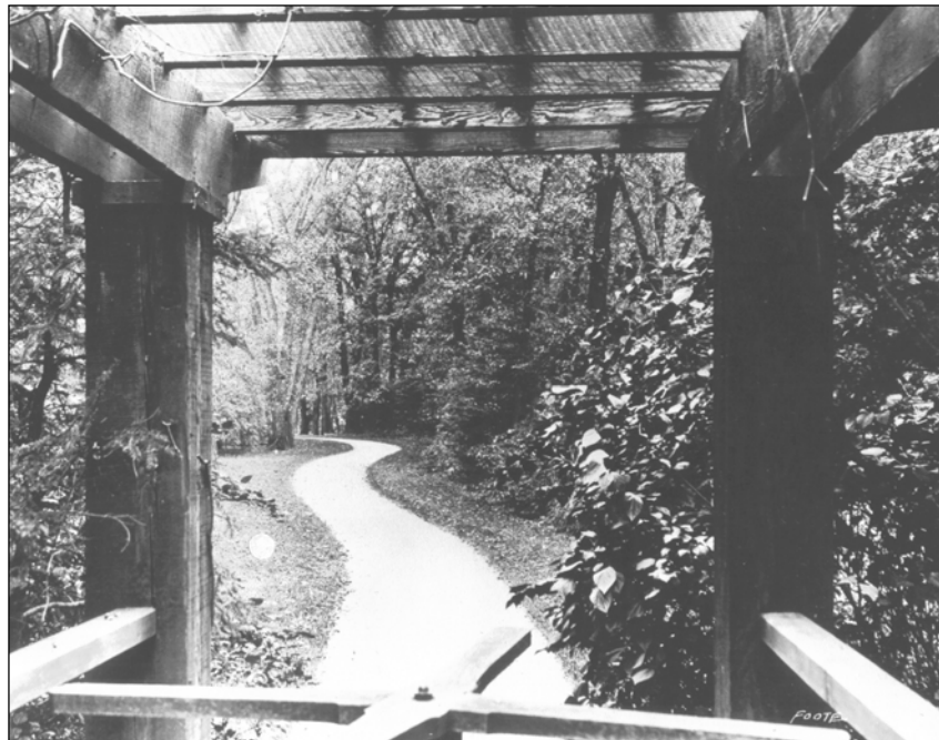
Plate 6 – A view of the extensive grounds of Kilmore, 1924.