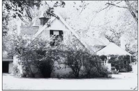
61 ROSLYN CRESCENT STABLES