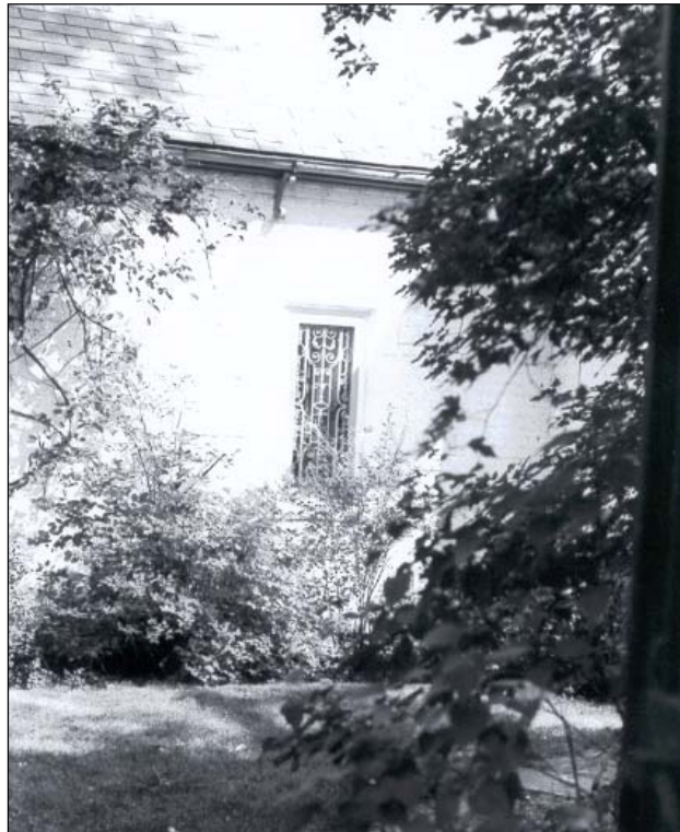
Plate 13 – A window grate on the gatehouse, 1980.