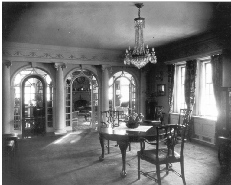
Plate 4 – An Adams treatment of the dining room, with glass doors leading into the sunroom, ca.1924. From the sun room came the red quarry tile used in the gatehouse alterations. This style of columns and arches was used in several houses in the immediate area and one can presume some borrowing of ideas among the architects.