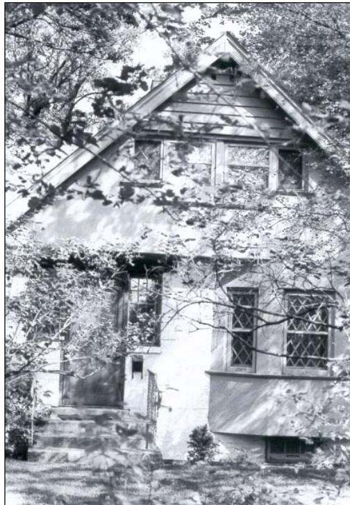
Plate 11 – The front of the gatehouse, 1980. The surface is painted brick. The bay window is in the dining room and the upper windows were in Lady Nanton's room.