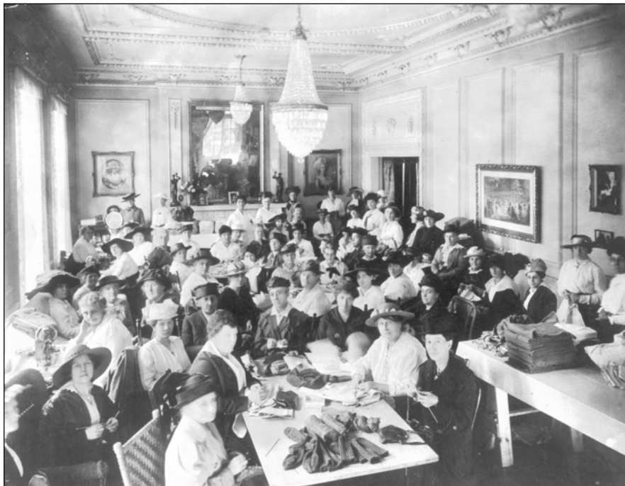
Plate 9 – Music room of Kilmore converted into a work room for the 27 th Battalion Working Guild, ca.1916.