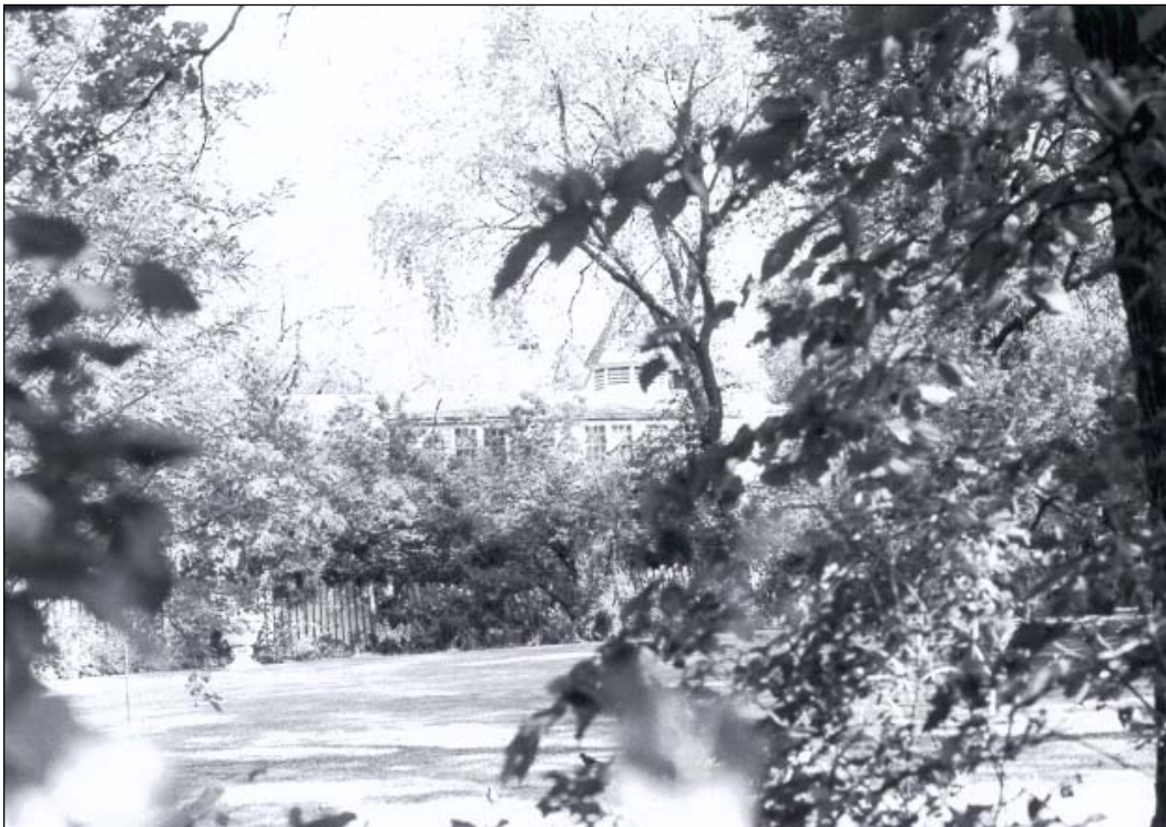
Plate 15 – The stables seen from the main gate, 1980.