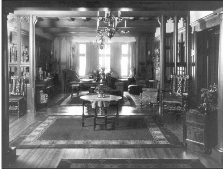
Plate 3 – The hallway and a sitting room in Kilmore, ca.1924. The oak panelling has a trefoil pattern. The stone fireplace and some of the fixtures were removed before the demolition of the house in 1935 and added to the former gatehouse.