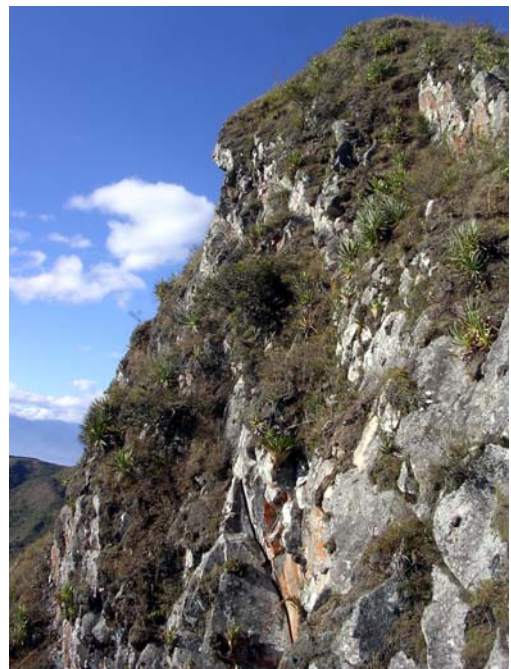
Fig. 2. Vizcacha habitat at Cerro Ahuaca (2450 m).

The vizcacha at Cerro Ahuaca is unknown to the local people in Cariamanga and is not hunted. However, this population faces other threats. The major threat is fire, widely employed to establish and maintain crop fields and pastures throughout the region. Such fires regularly escape control destroying large areas of vegetation on the Cerro. Thus, fire destroys the food resources of vizcachas, alters their habitat and may kill animals directly. Furthermore, domestic cattle that graze summit and periphery of the Cerro compete for food with vizcachas. This may result in a reduced carrying capacity of the vizcacha habitat and, consequently, population size (Walker et al., 2000). Suitable habitat does not appear to occur anywhere close to the Cerro except from some isolated outcrops around its imme-