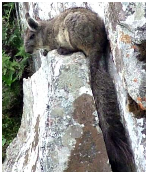
Fig. 3. Mountain vizcacha ( Lagidium cf. peruanum ) at Cerro Ahuaca.

diate base. Fragmentation of their rocky habitat is generally common, and colonies of vizcachas are often separated by 10 or 20 km even in uniformly suitable habitat (Grimwood, 1969). This makes a metapopulation structure presumable which could increase the survival ability of the population under pressure (Walker et al., 1994). However, we estimate that this population may comprise no more than a few dozen individuals. Furthermore, with 1–2 offspring per year (Rowlands, 1974; Weir, 1974) vizcachas have low reproductive potential, another characteristic rendering them prone to extinction (Henle et al., 2004).